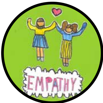
Zoya Mostofi, 3W