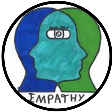
Lochie Chesney, 5R