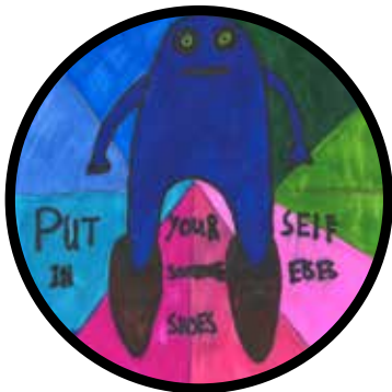
Oscar Backen, 4D