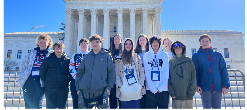
Students who attended the D.C. trip pose in front of the Supreme Court building.

Speaking as a chaperone, I could not have been more proud of how our students represented themselves and Newman. They were well behaved, attentive, and reverent at all times. Watching them interact with the places and documents that define American history was a great experience. The questions they asked and conclusions they reached were