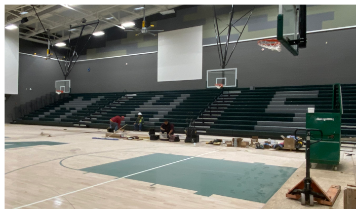
Shown is the interior of the new Manteca High gym. Construction on the gym is nearly complete and it should be in use for the 2022-23 school year.

Elementary schools are not the only sites that have benefitted from local tax dollars. Phase 2 also covered extensive work at East Union, Manteca, and Sierra High Schools. Manteca High built 10 new classrooms and a