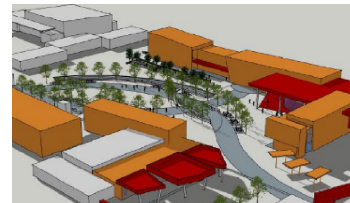
Left: an image from the MHS Schematic Design shows the cafeteria expansion and outdoor seating areas as well as the new 2-story classroom building on the top right. Right: an image from the EUHS Schematic Design shows the new 2-story classroom building and new quad area which will be a mixture of landscaped and hardscaped areas.

In 2020, the $260 million bond Measure A passed with approval from 57.66% of local voters. Measure A will provide dedicated facility funding, in alignment with our