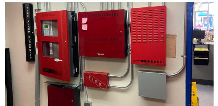
As a part of Measure G and A projects, all MUSD schools will receive upgraded fire alarm/emergency communications systems.

5-10 Year Facilities Plan , continue upgrading classrooms and facilities for safe in-person learning: improving campus security/emergency communication systems; addressing aging electrical, heating/ventilation, roofs, and plumbing, and updating job training facilities.