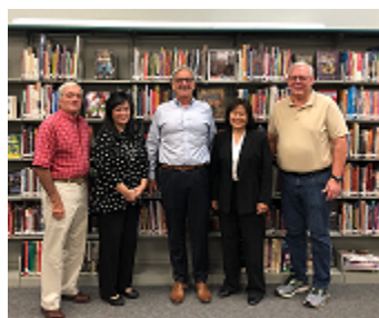
Measure A Oversight Committee Members

The Citizens' Oversight Committee was established to actively monitor all bond expenditures for Measure A funds. Measure A is a $48.5 million bond measure that was approved by voters on June 5, 2012. The measure authorized funding to install solar energy projects, increase student access to modern technology, improve energy efficiency, renovate and construct new buildings.