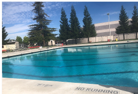
Lincoln High School Pool Project