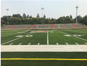
Lincoln High School new field turf