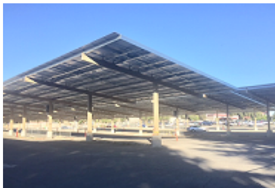
Lincoln High School Solar Project