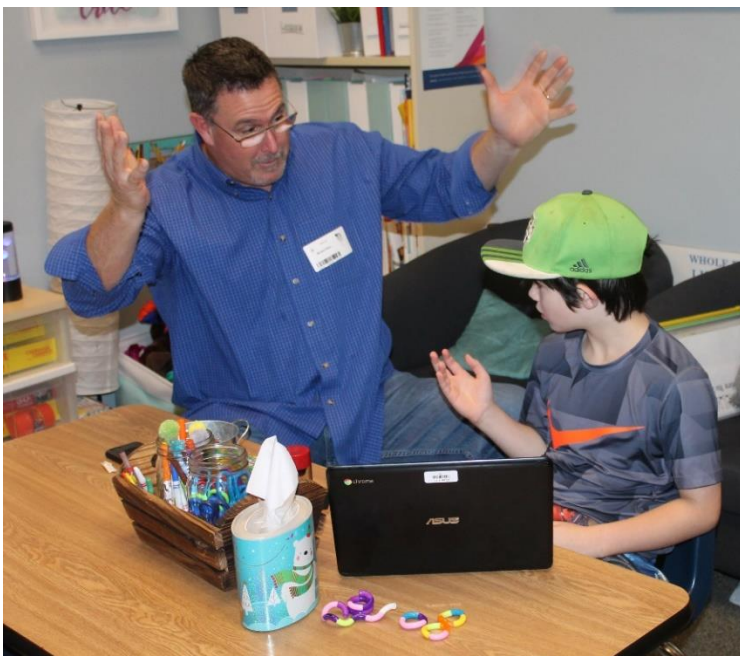
Youth Success! Mentors meet with the same student at school each week, providing a supportive relationship with a trusted adult. Empower Youth Network works with our schools to match up students and train these volunteers.

Disclosure of student information by a volunteer is a violation of the Family Education Rights and Privacy Act of 1974 (FERPA) and may subject the volunteer and the district to civil liability. It is very important that you keep information about students confidential. Do not make references to students' abilities in front of other students. The only person who should be told about a student's work is their teacher. If parents ask about their student's progress, suggest in a friendly way that they contact their teacher.