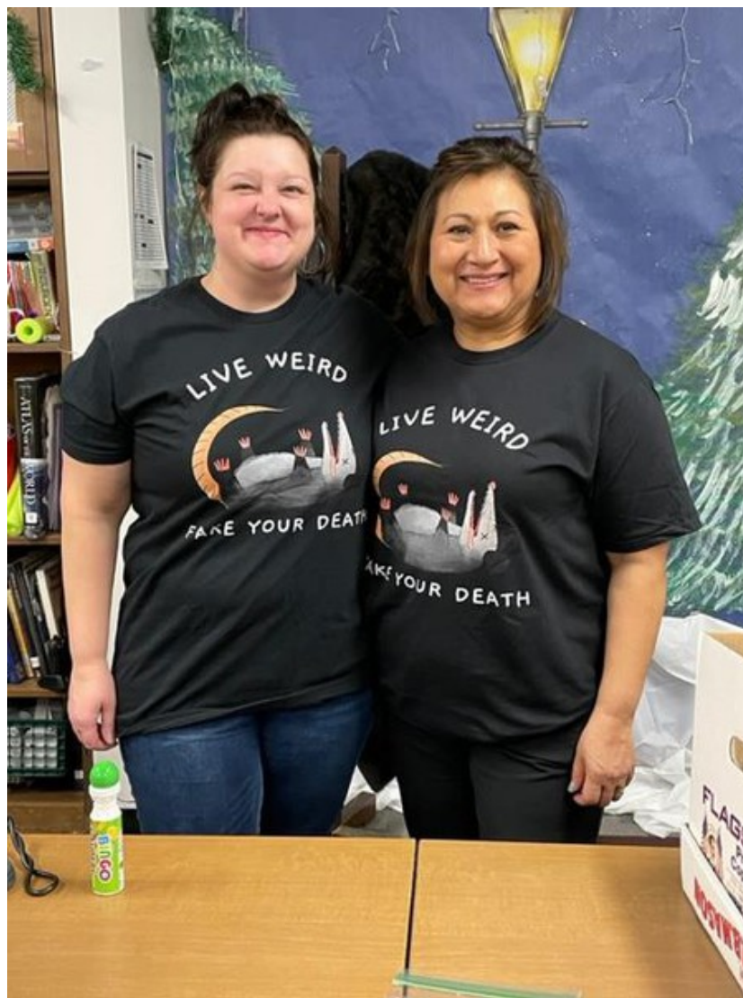
Student Tunnel at the Binghamton Black Bears Game