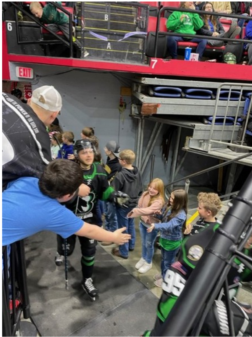
3rd Place Archery Team