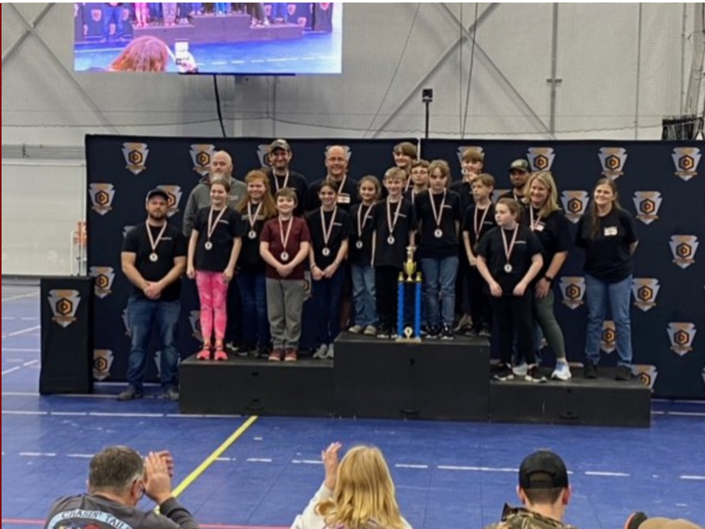
Annual Spring Fair