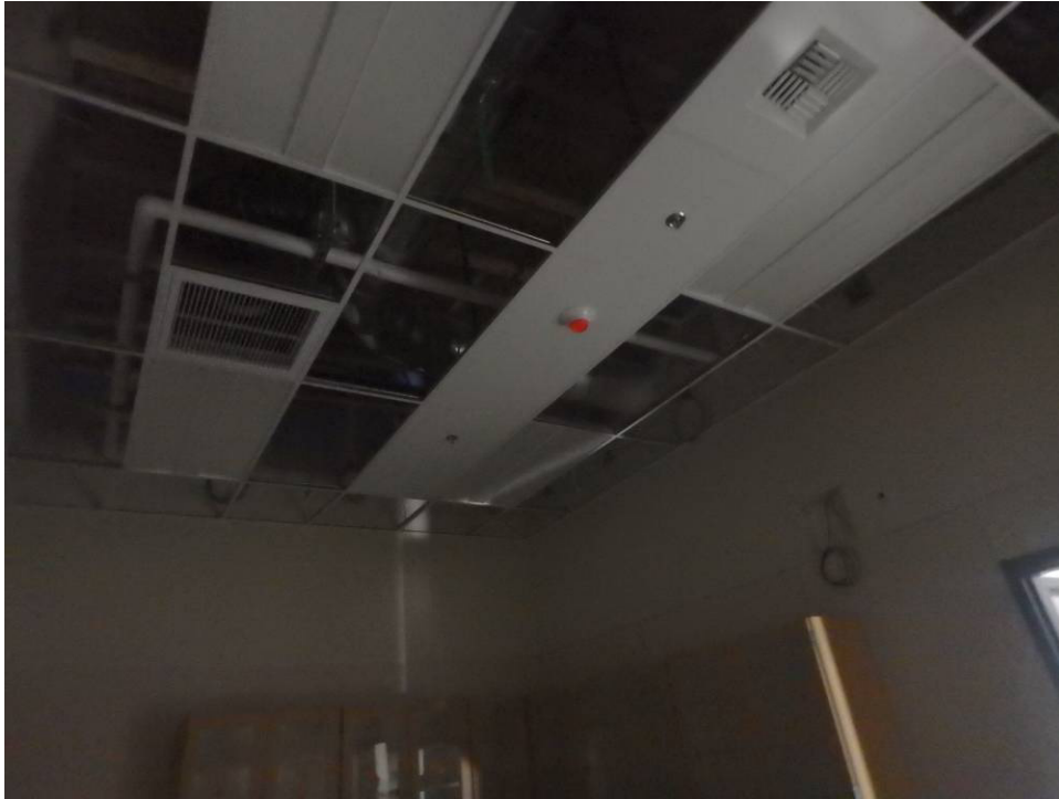
Exam room ceiling