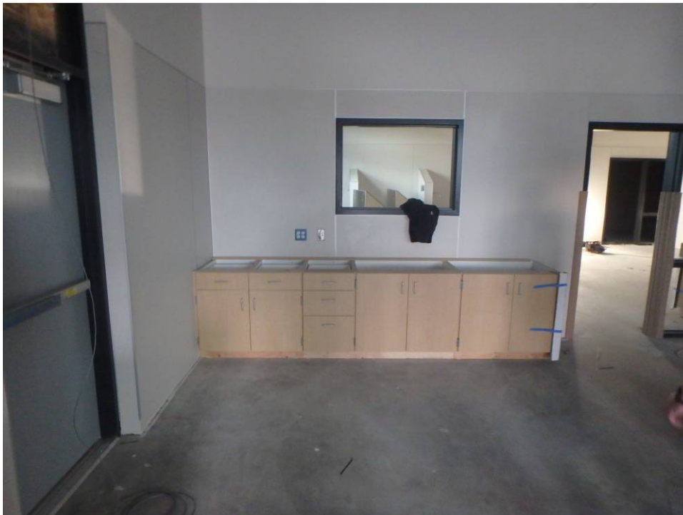
Casework in the South classroom – looking west