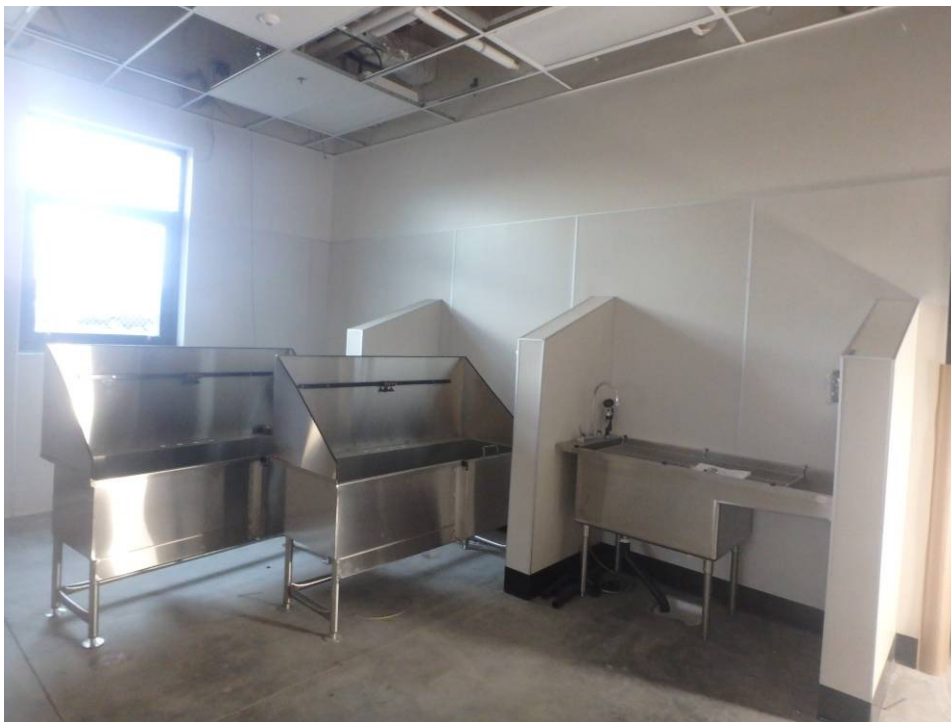
Dog wash dividers with FRP