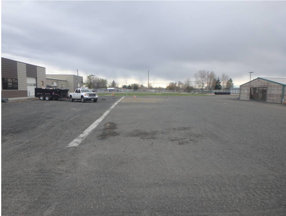
Looking north on the east side of the site