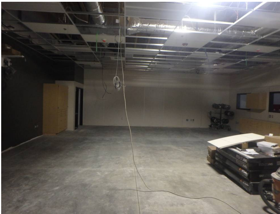
Looking west at the west wall of the north classroom and ceiling grid