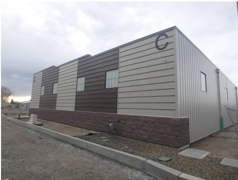
Looking east at the north curb and gas meter