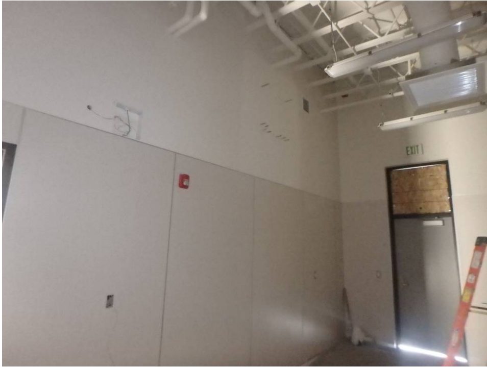
Wallboard repair at the manifold to be relocated in the Kennel Room and FRP