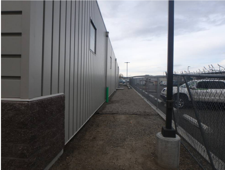
Looking south at the west property line and back of building