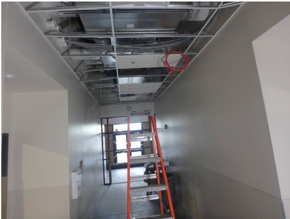
Looking east towards the entry from the west end of the main corridor