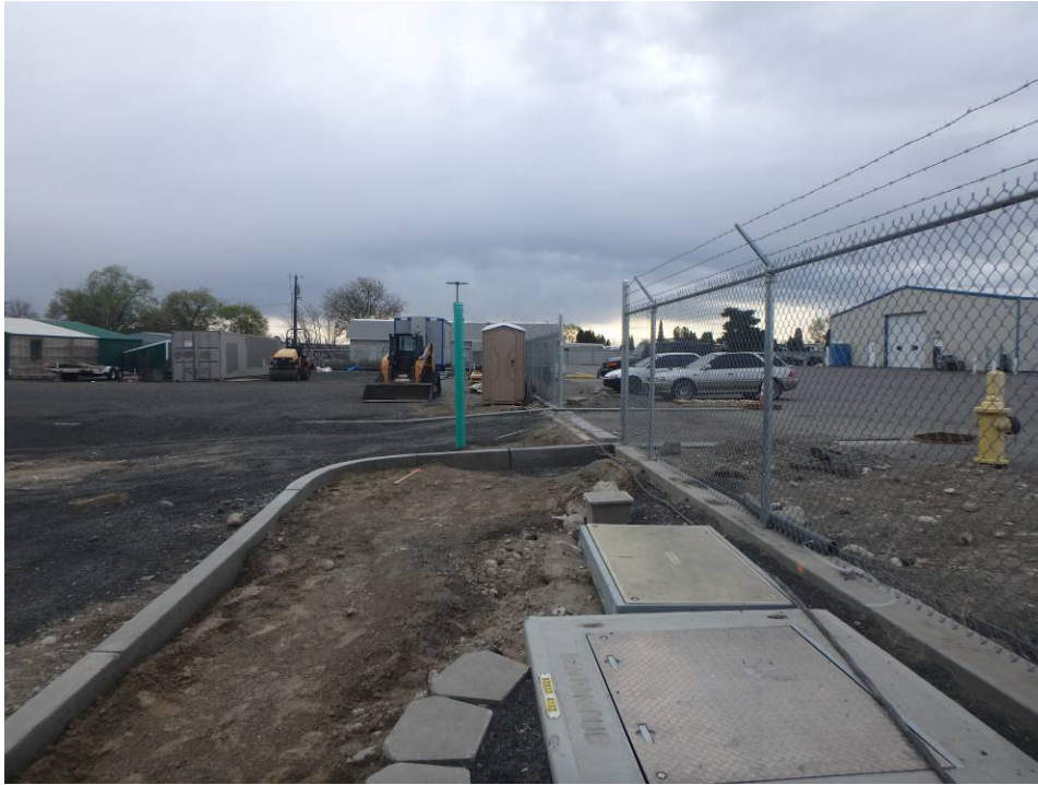
South site entry