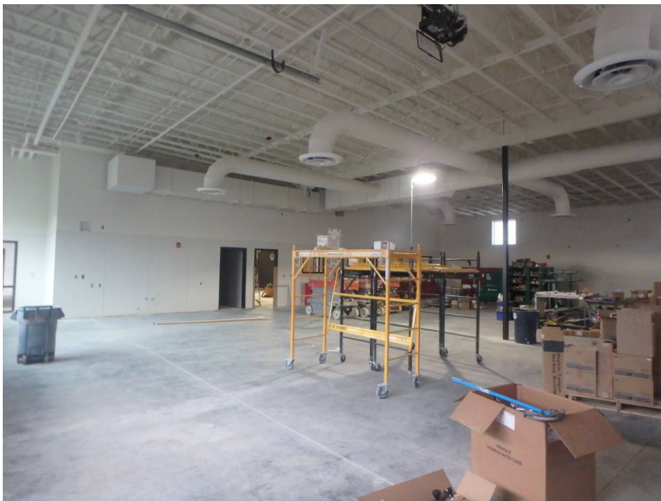
Looking southwest across the shop