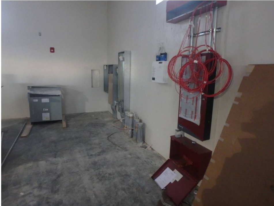
Wiring at the fire alarm panel, Electrical panels and transformer