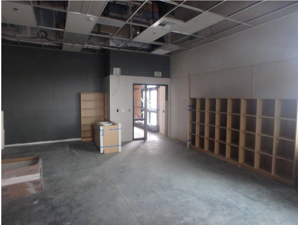
Looking at the northeast entry of the south classroom