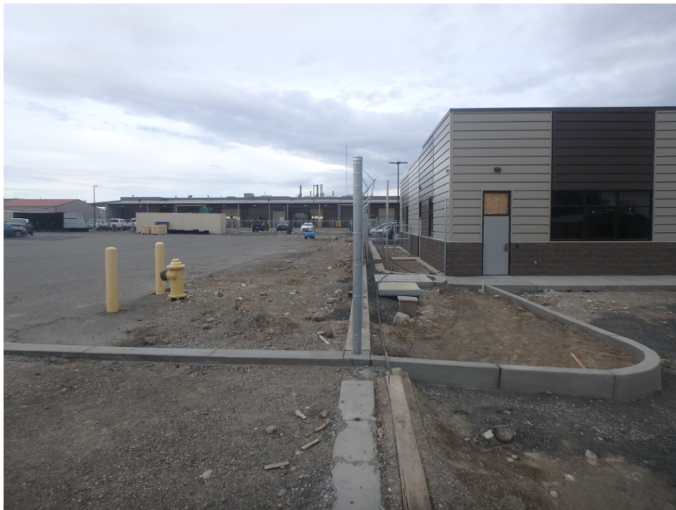
Southwest curb at site entry and Southwest peninsula and the southeast corner of the building and south property line fence