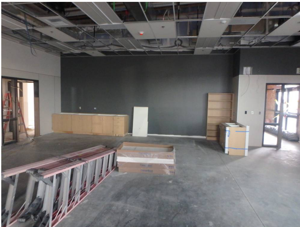
Looking at the north wall of the south classroom