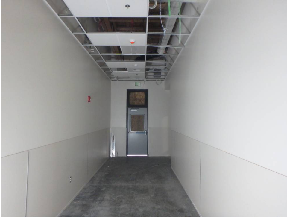
Looking west at the west end of the east-west (main) corridor