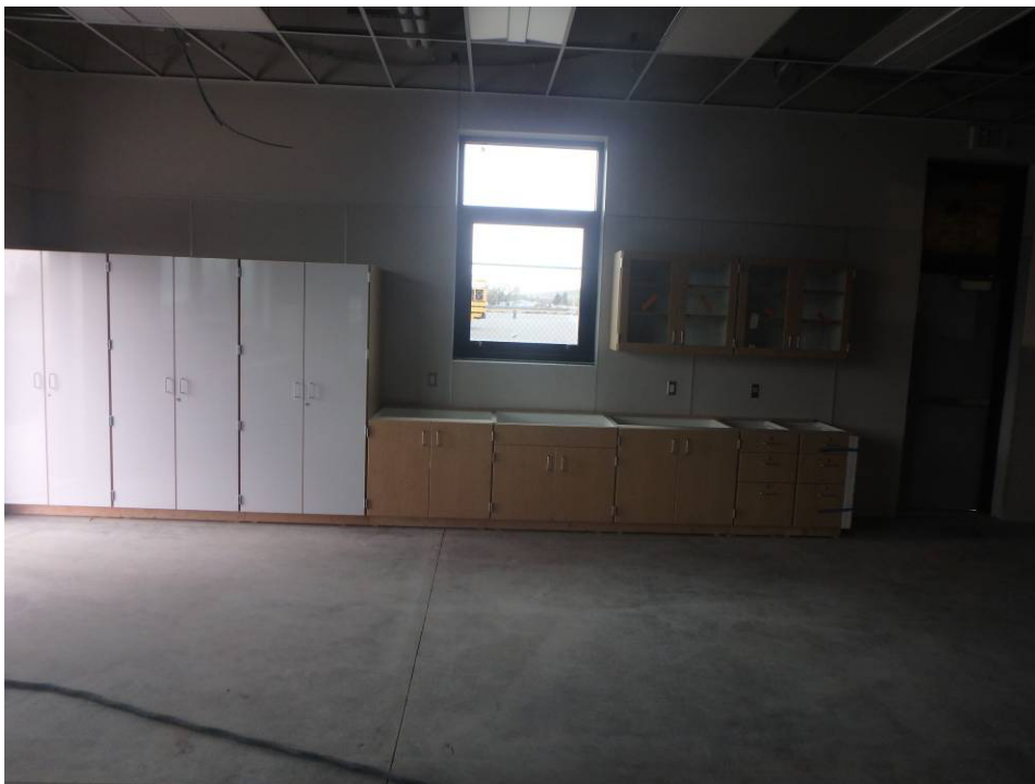
Looking at the South wall of the south classroom - Casework