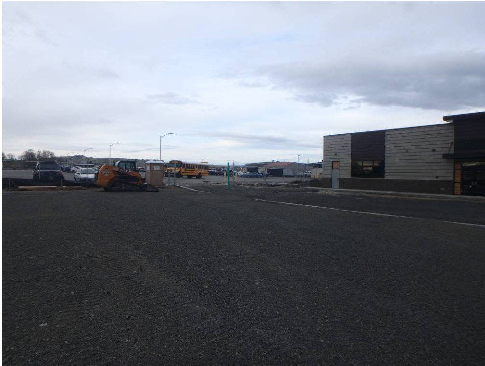
South site entrance east side