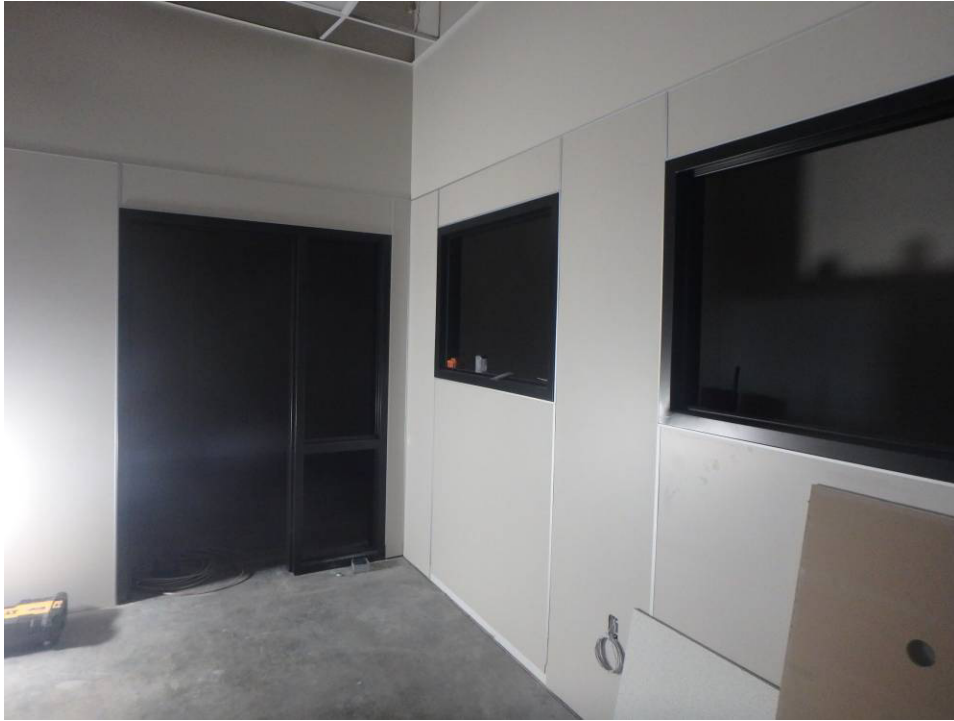
Looking northwest at the Lab's north wall and office wall