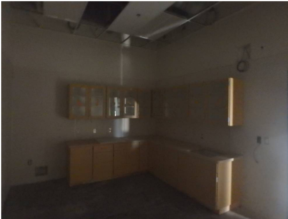
Casework in the Exam room