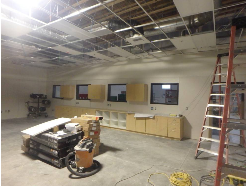
Looking at the north wall of the north classroom and casework and ceiling