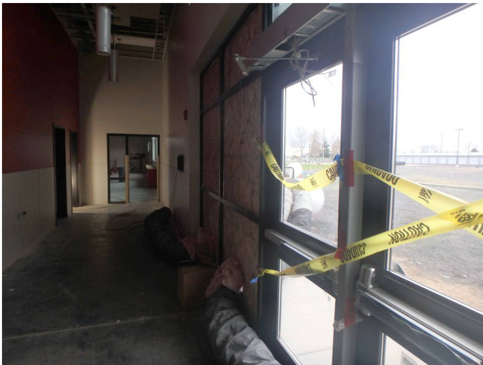
Main entry doors