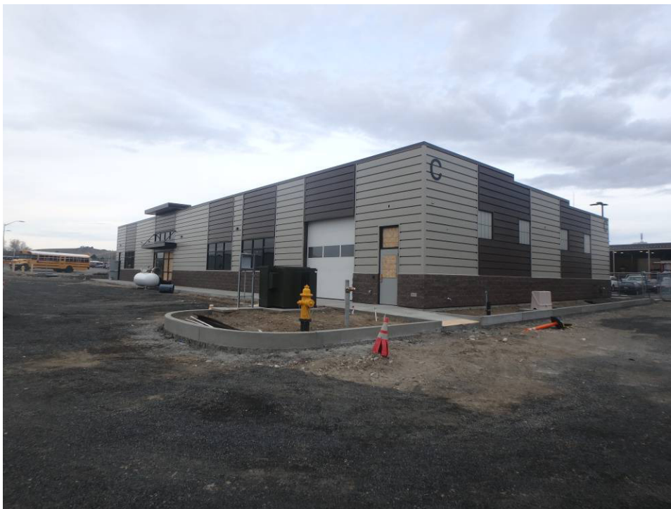
Northeast corner of the building