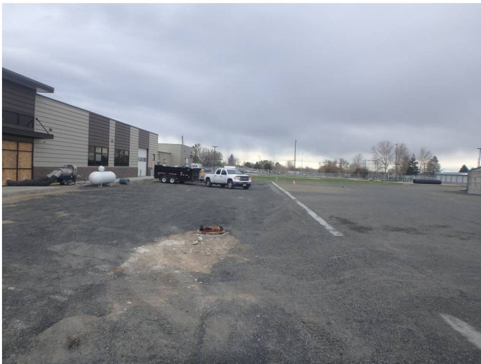
Looking north at the central curb and grading