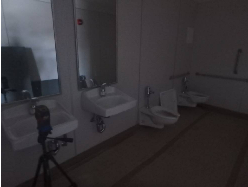
Typical restroom FRP walls and plumbing fixtures