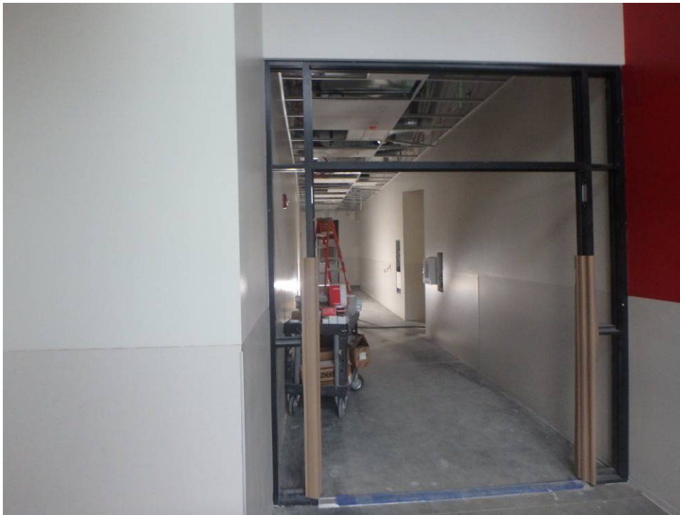
Main entry looking east into the east-west corridor