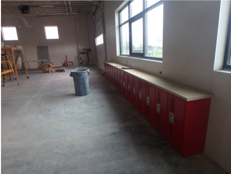
Looking north along the shop's east wall and lockers