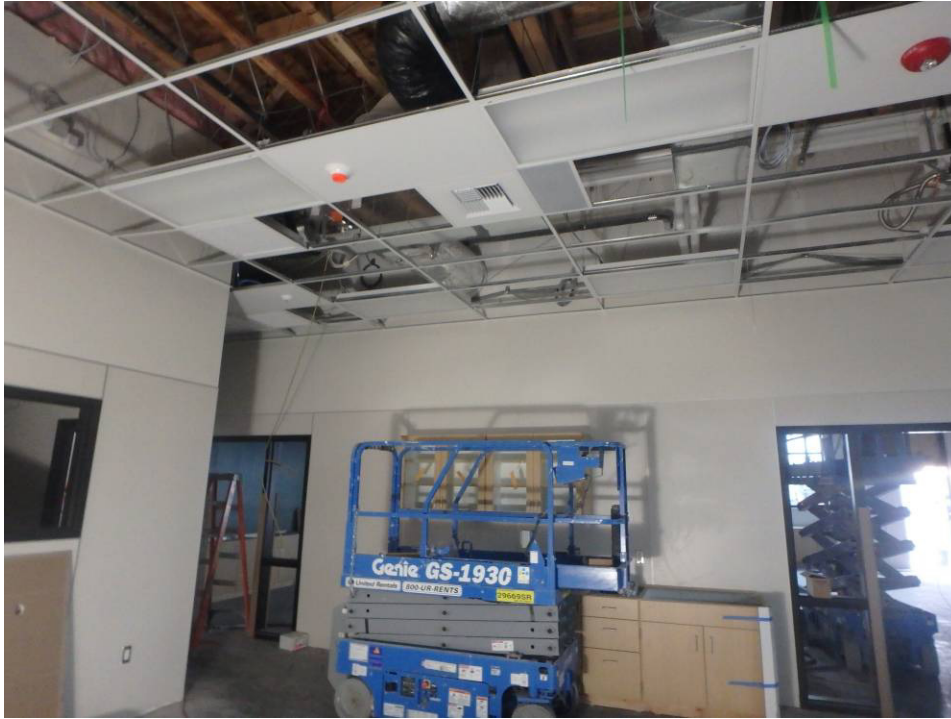
Lab – northeast corner