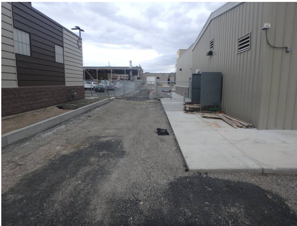
Alleyway – looking west