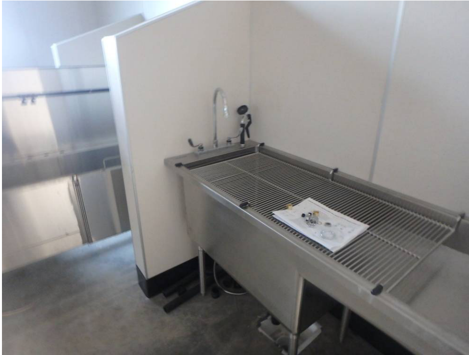
North dogwash station