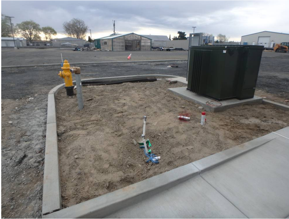
Curb at north end of building – looking east