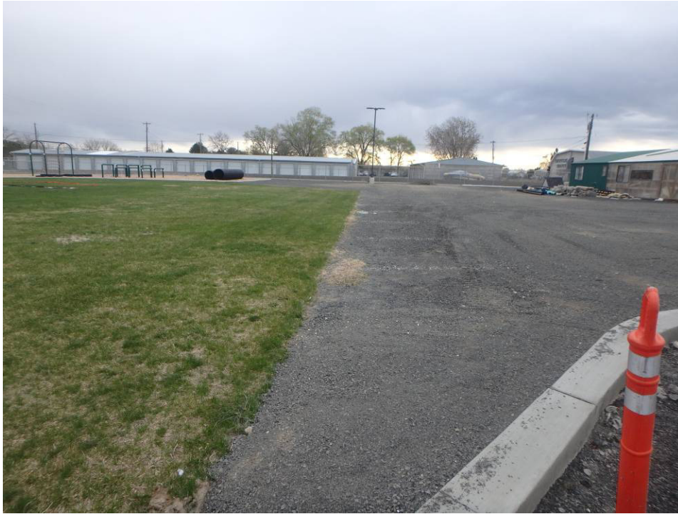
Looking east at the north property line