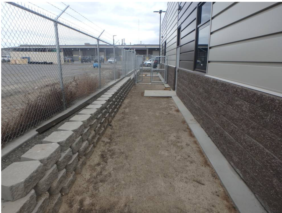
Looking west along the south side of the building Main entry