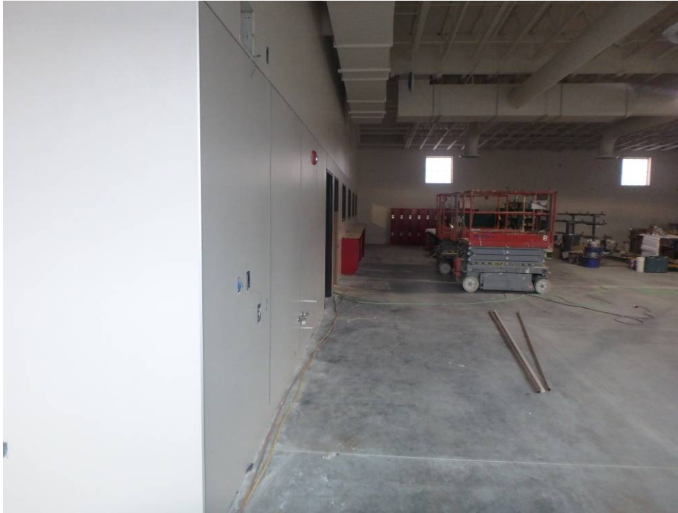
Looking west across the shop along the south wall and lockers