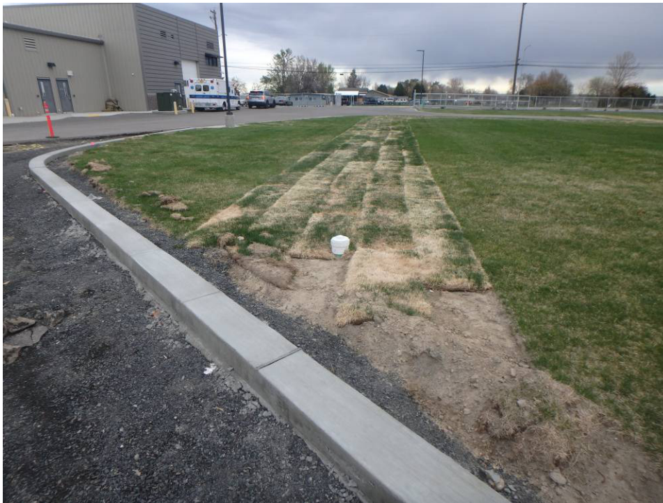
North site curb and sod