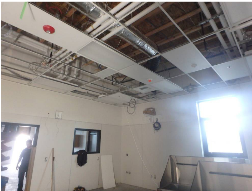
Lab – southeast corner