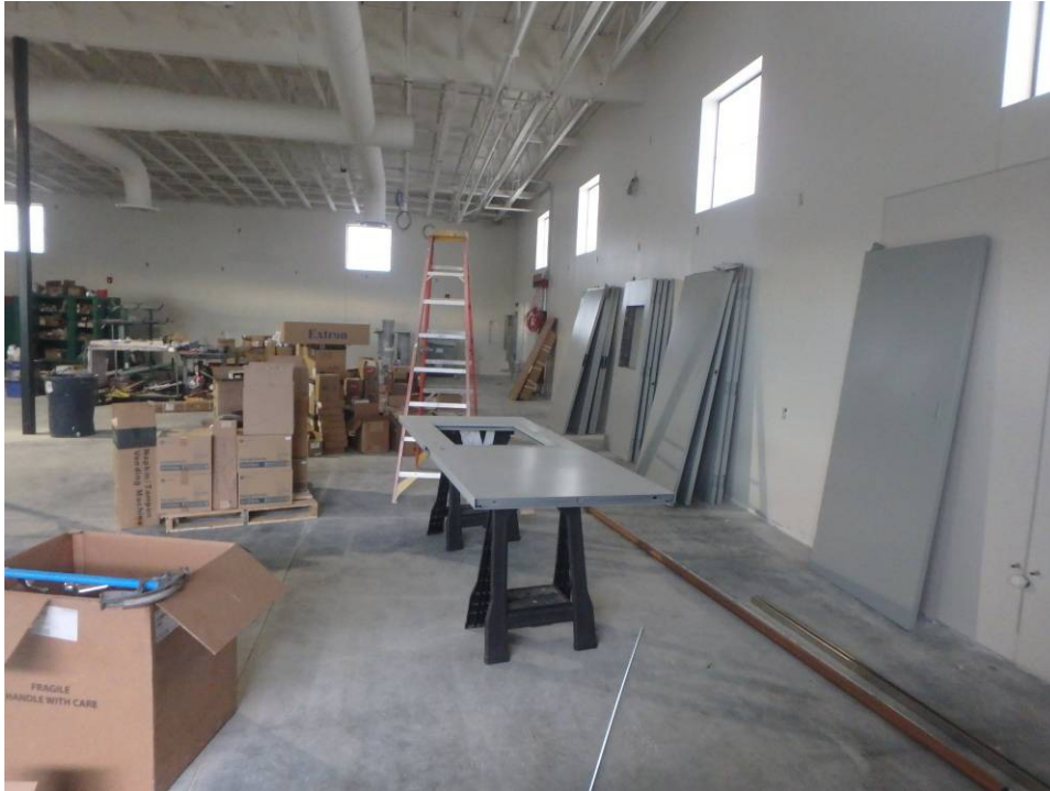
Looking west along the north wall of the shop