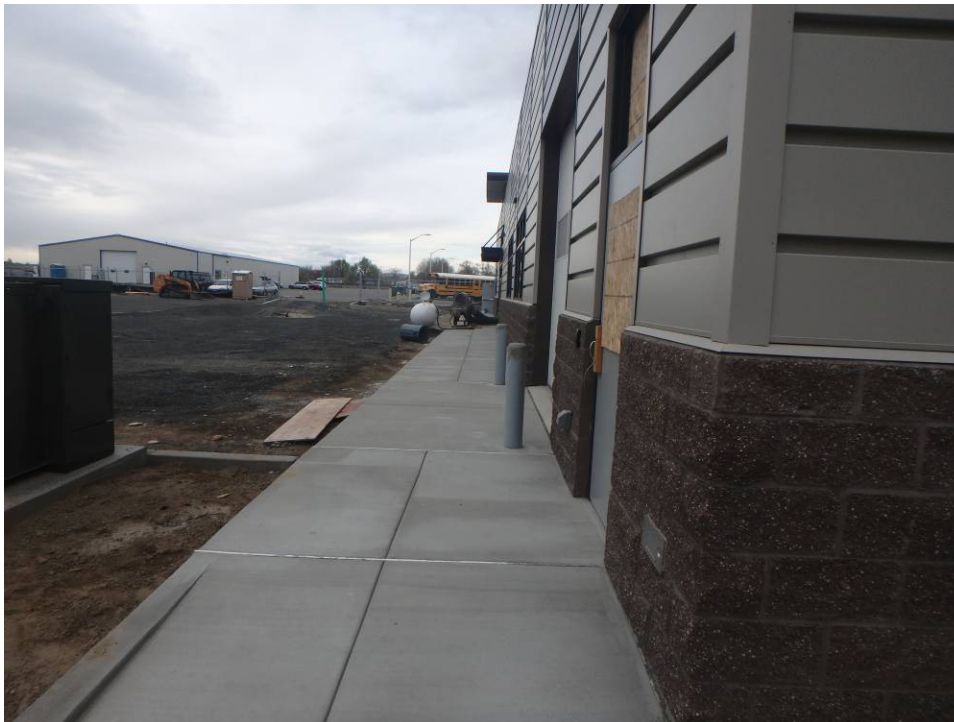
Looking south along the front sidewalk