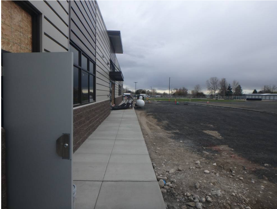
Looking north along the front sidewalk