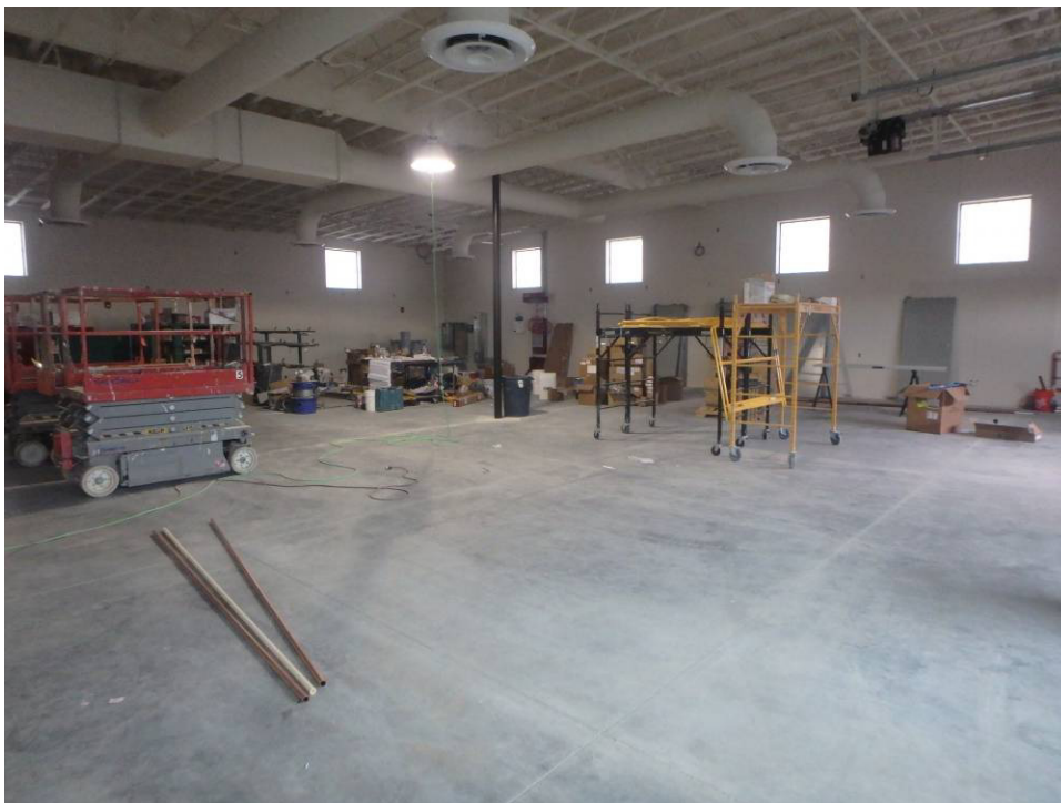
Looking northwest at the shop's north wall