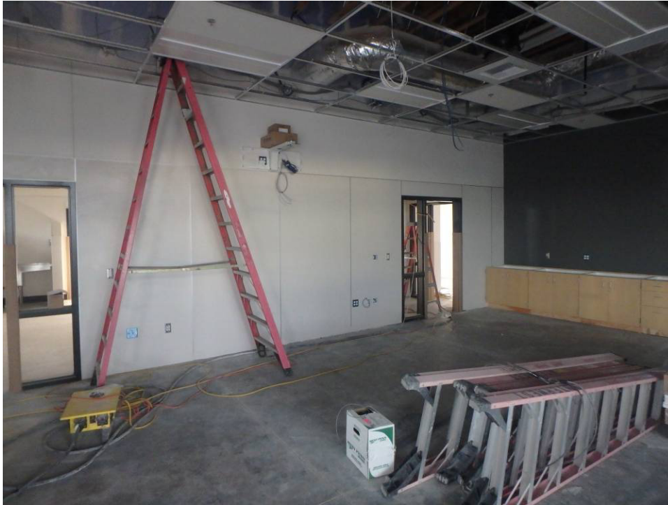
Looking at the northwest corner of the south classroom