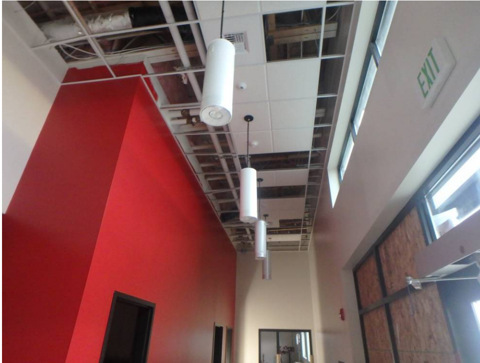
East corridor looking north at new pendant lighting and ceiling