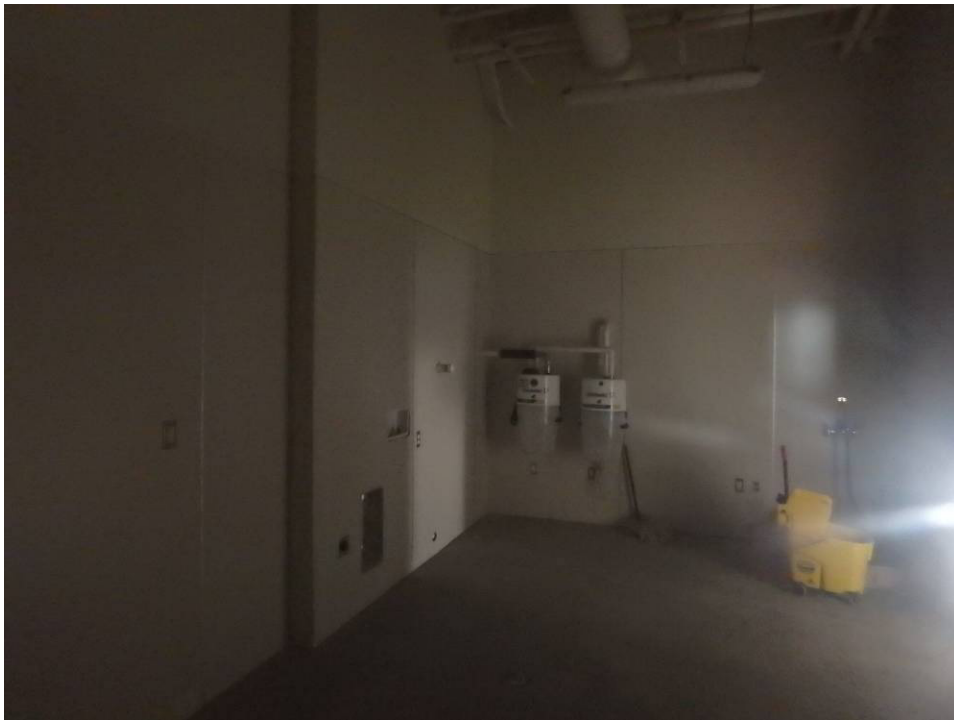
Kennel – vacuum and janitor's sink