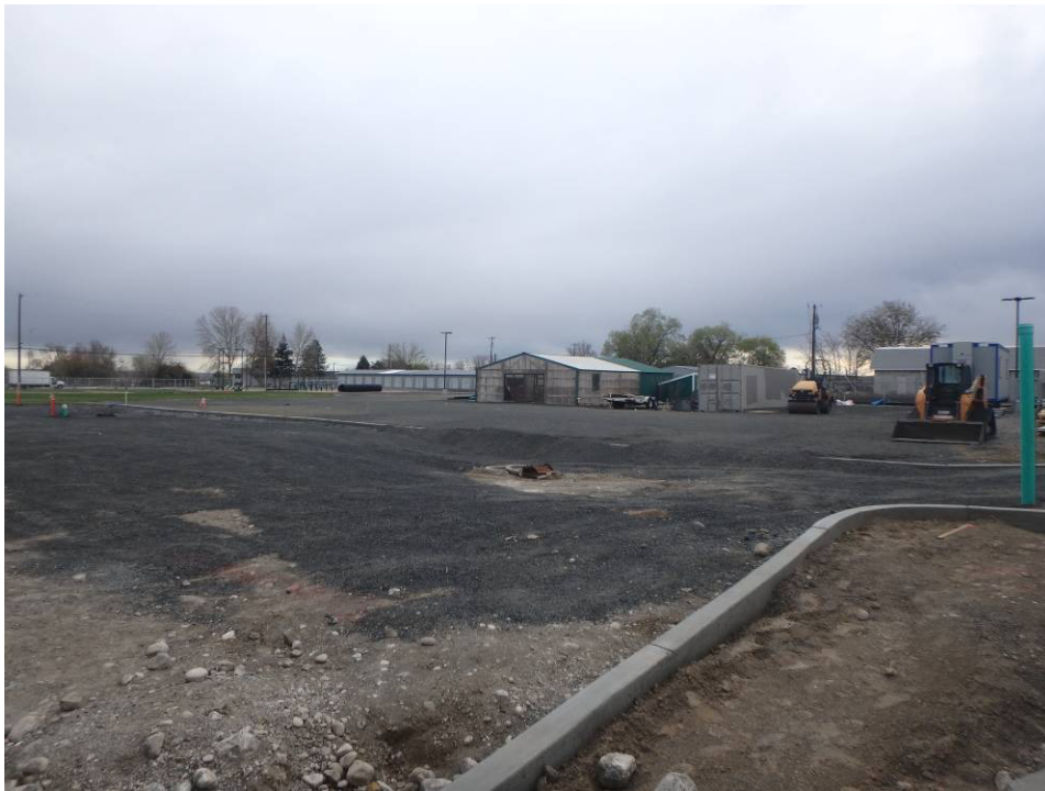
Looking northeast across the site