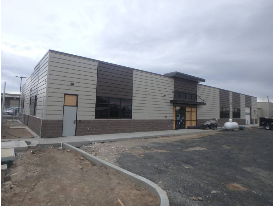
Southeast corner of the building