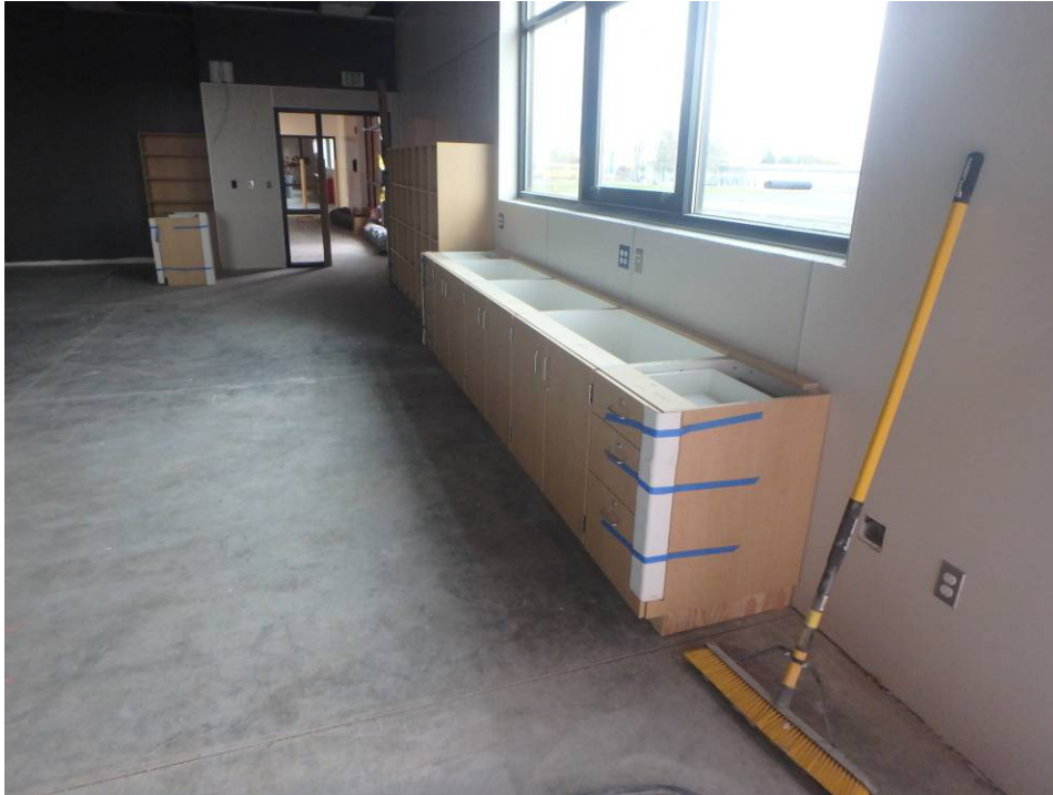
Looking at the east wall of the south classroom