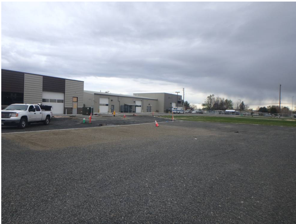
Looking northwest at the north site