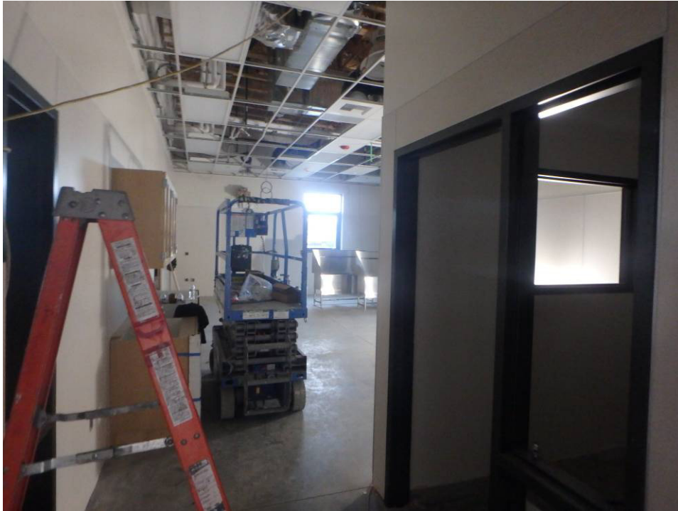
Looking south in the lab