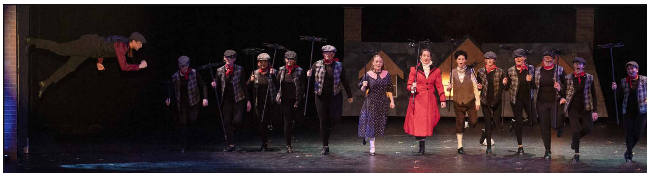
An evening of fun with a touch of magic at the CCPAC! Hope you had a chance to experience the amazing Senior High School musical, "Mary Poppins"!