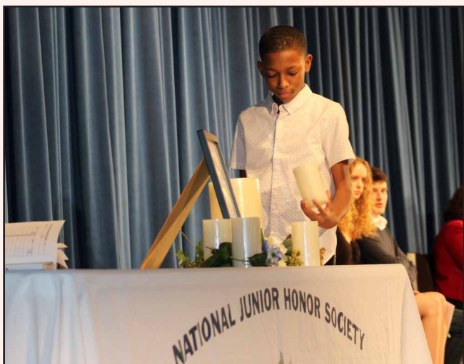
National Junior Honor Society (grades 8-9) welcomed 75 new members to its ranks this year in a recent induction ceremony. Congratulations!