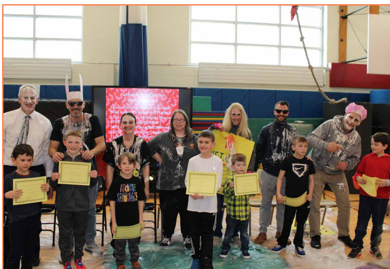
Students at Fairbanks Road School raised an astounding $20,068 in their first year participating in the American Heart Association's Kids Heart Challenge. They also took special PE classes and learned that being active is fun and keeps their hearts healthy.