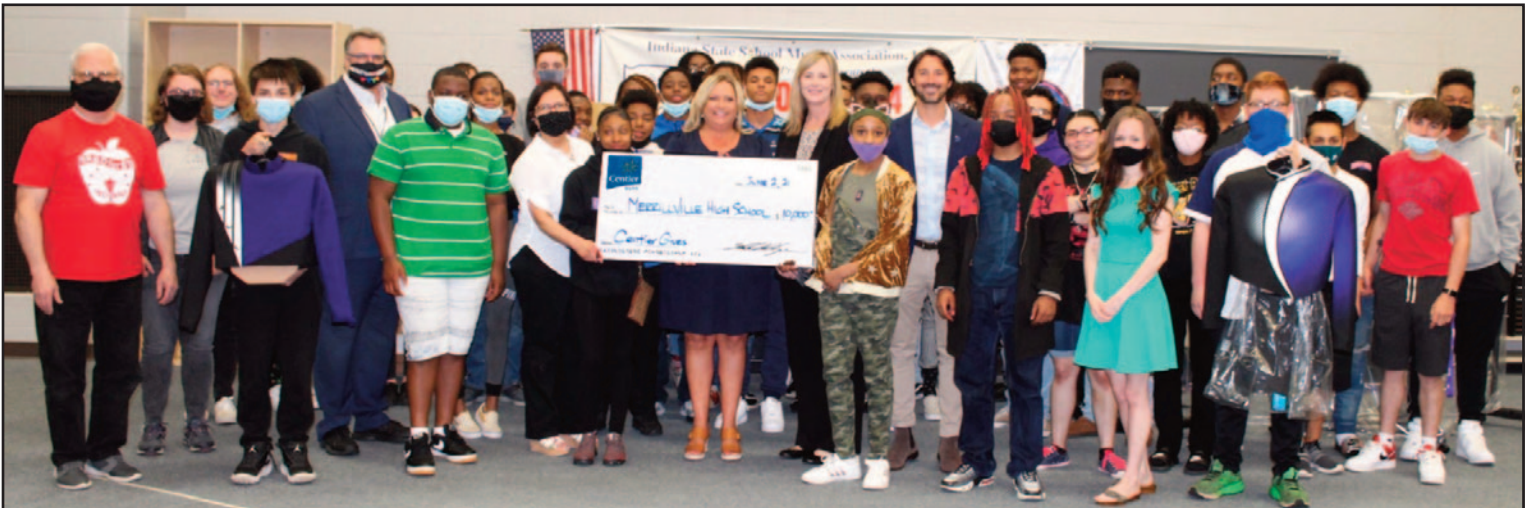
Representatives from Centier bank present a check for $10,000 to the Merrillville Community School Corporation staff and students.

"The members of the school band have earned these uniforms due to their hard work, passion, and dedication to their craft, and this gift is an acknowledgment of their sacrifice and success," he continued. "They deserve them."