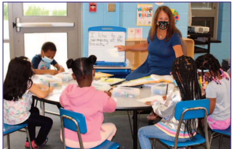
The Summer Boost Program operated with a ratio of five students per teacher to give students extra support and attention after a challenging school year.

The Summer Boost Program, a unique summer school experience, was a prime example of where a lot of this money was invested. The school corporation identified 531 children in grades 2-7 based on their