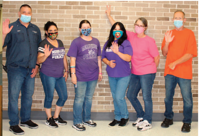
Some of our Merrillville Intermediate School custodial staff.