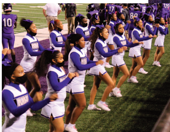
Cheering on our Pirates!