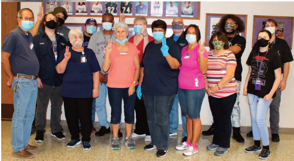
Some of our MHS custodial crew.