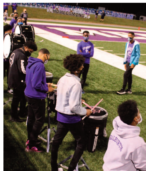
What would Homecoming be without the MHS Band of Pirates?