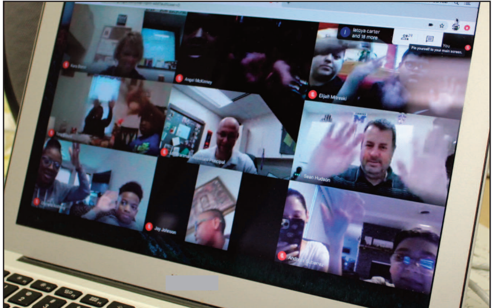
Breakfasts for students and parents are held to celebrate Students of the Month at Merrillville Intermediate School. Last month, students, parents and principals gathered online for a virtual celebration.