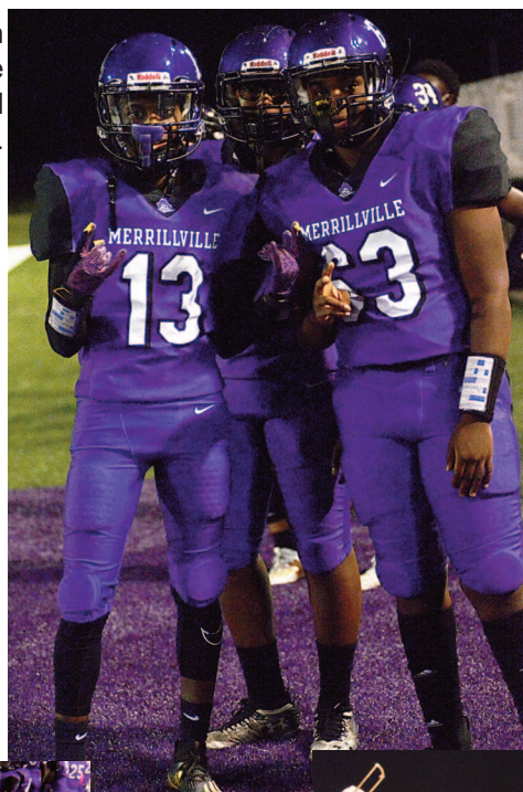
Pirates win over Lake Central Indians.