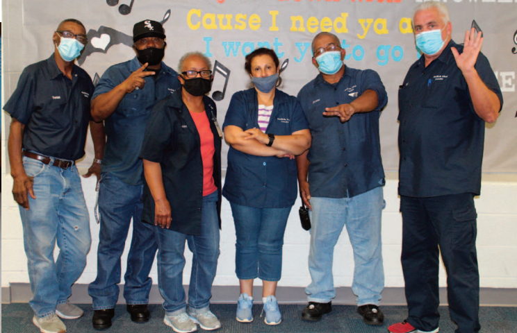
Some of our Pierce Middle School custodial staff.