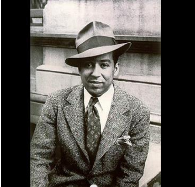
► I, Too, Sing America— Langston Hughes – YouTube