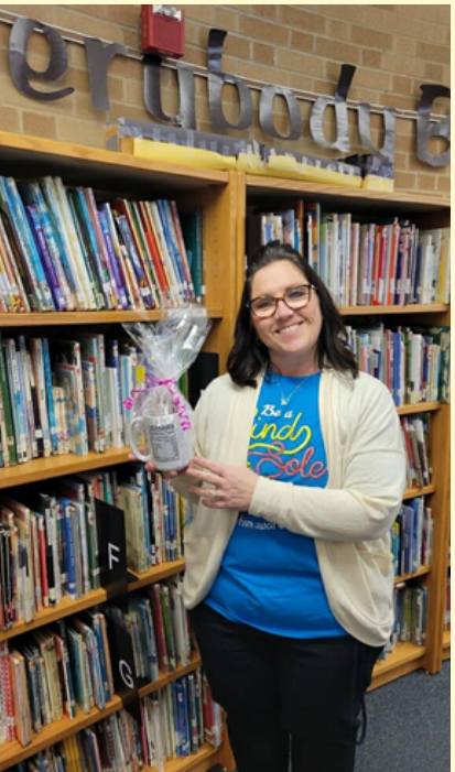
National School Librarian Day