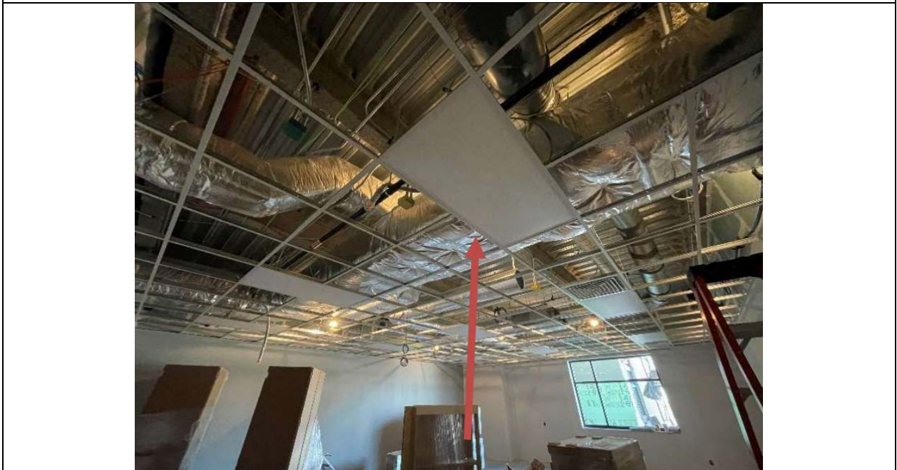
Light fixture install