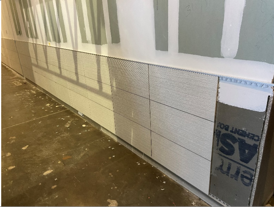
Porcelain tile at Restrooms