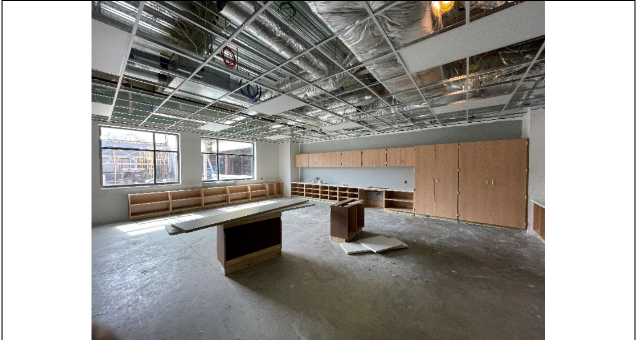
Classroom casework area C