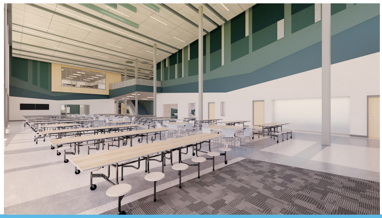
NEW ELEMENTARY SCHOOL RENDERED CAFETERIA