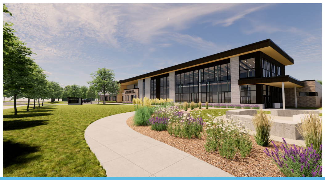
NEW ELEMENTARY SCHOOL EAST FACADE