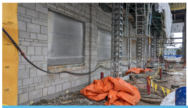
VEL PHILLIPS MIDDLE SCHOOL EXTERIOR STONE