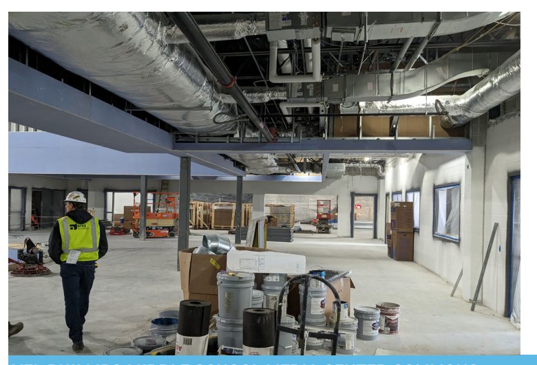
VEL PHILLIPS MIDDLE SCHOOL MEDIA CENTER COMMONS