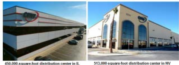
450,000-square-foot distribution center in IL

CDW holds more than $300M of available inventory in our two CDW-owned distribution centers that total almost 1M square feet. Our ISO 9001, 14001 and 28000 certified strategically located distribution centers provide speed, accuracy, and excellent geographic coverage across the United States. We have access to more than 100,000 top brand-name products from more than 1,000 leading manufacturers.