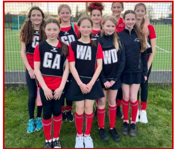
On Wednesday 22nd March our Year 7 team took part in the South Warwickshire Tournament held at Stratford High School.