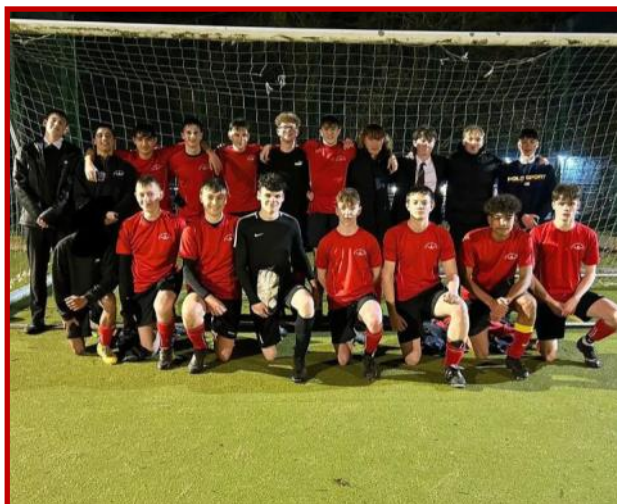
On Wednesday 25th January our Year 11 team drew 1-1 in a match against Studley High School.