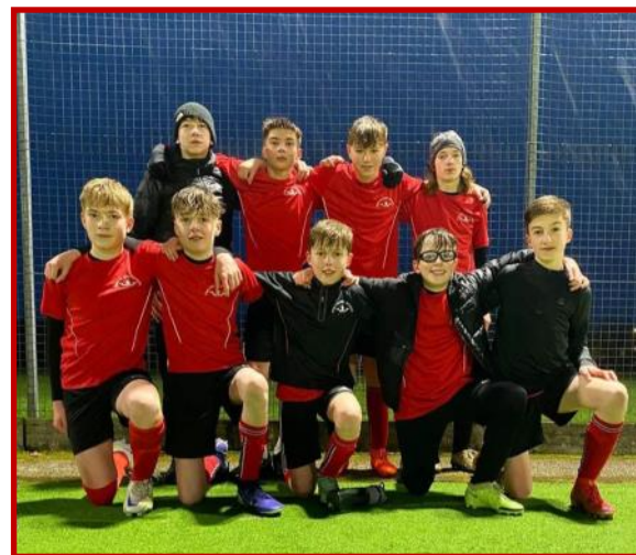
Congratulations to our Year 9 football team who won the Mid & South Warwickshire 6 a side Tournament on Wednesday 25th January.