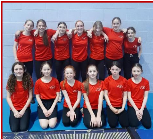
Well done to our Year 7 and 8 girls Athletics teams who came 2nd and 6th at the South Warwickshire Indoor competition on Monday 30th January.