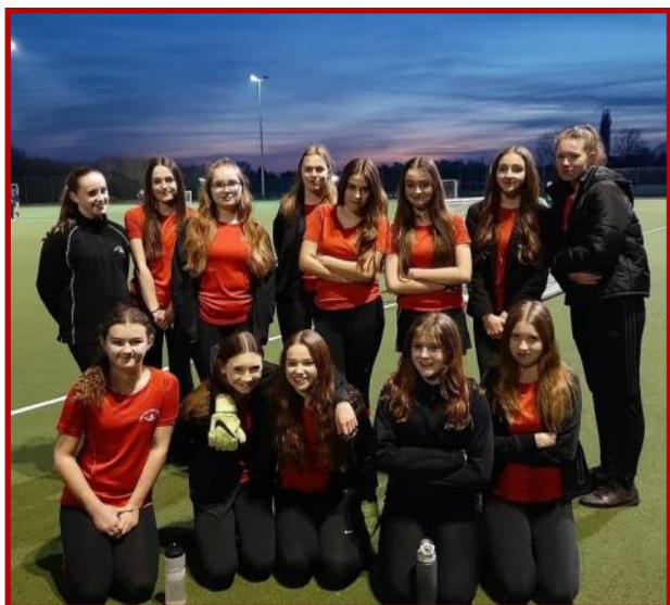
Well done to our U16 and U14 girls teams who came 4th and 5th in the South Warwickshire 7 a side Tournament on Wednesday 8th February.