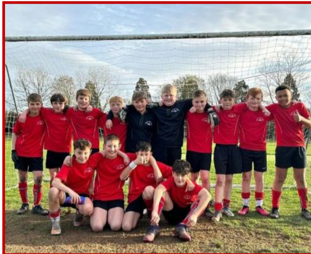
On Tuesday 21st March our Year 7 boys team played Henley School. The final score was 1-1.