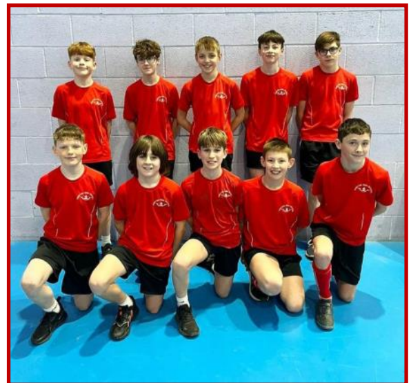
On Tuesday 31st January our Year 7 and 8 boys teams took part in the South Warwickshire Indoor competition at Alcester Grammar School and came 4th and 7th.