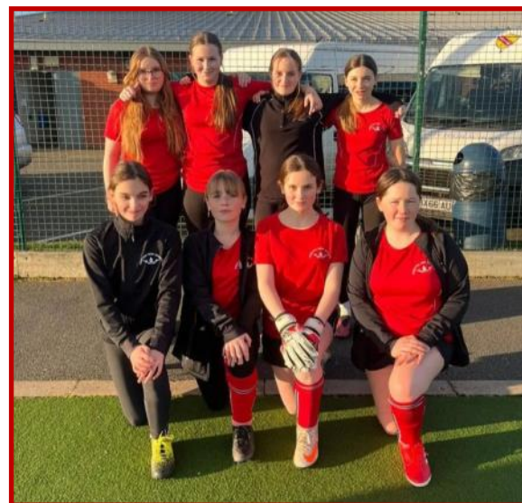
Tuesday 7th March saw our Year 7/8 girls team take part in the South Warwickshire 7 a side Tournament at Stratford High School.