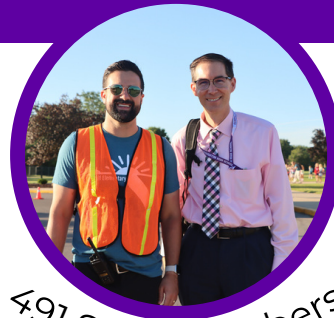
491 Staff Members

The Mission of the Stoughton Area School District is to ensure educational opportunities which challenge all students to achieve excellence, maximize their talents and abilities, prepare them to face the demands of the future, and be literate, contributing members of society.