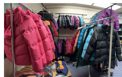
Winter jackets line the walls of the Marketplace.

Sometimes, the simplest things—a package of diapers, warm winter clothing, some extra food—can make a big difference. The