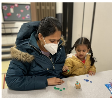
Enjoying time together during a Family Game Night at the FRC.

More than 200 students have participated in Expanded Learning's afterschool program this school year.