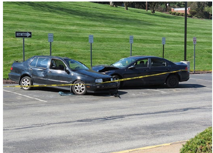
The mock accident was set up in the front parking lot of FCAHS to illustrate the dangers of drunk driving.