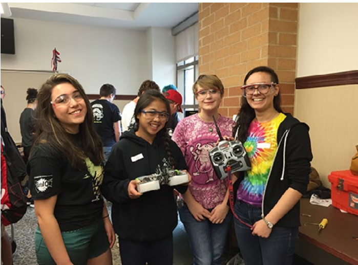
FCAHS's all-girls combat robotic team won second out of thirteen at the Combat Bots competition held at Pine Richland High School.

Combat Bots is a good example of STEM education at its best. Students each school year design the robot, design and fabricate the weapon, design and fascinate the wiring harness, design the control system and finally test and turn their own battle bot.