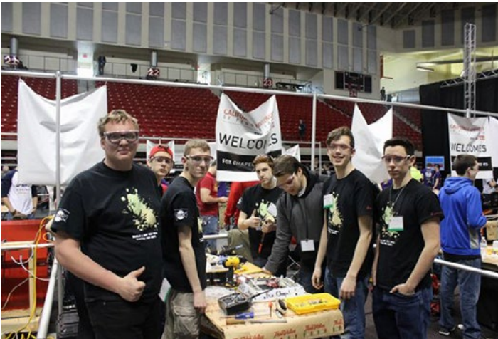
FCAHS's robotics team placed seventh out of eighty teams, and the robot won four out of five battles.

Students from Fox Chapel Area High School placed seventh out of 80 battle bots teams at the PA BotsIQ State Competition. The battles were held at California University of Pennsylvania on April 8-9, 2016.