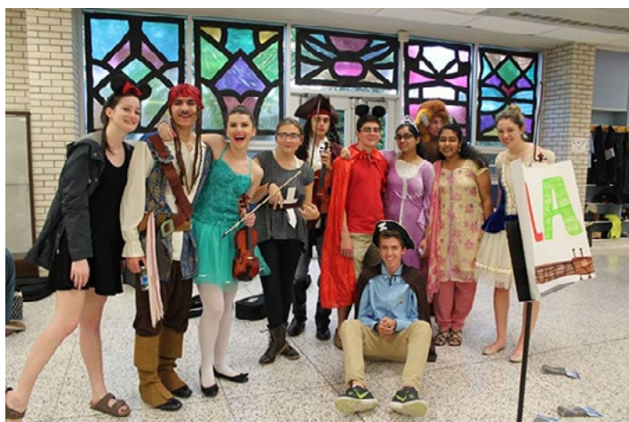
Members of the orchestra chose to dress up as Disney characters for the concert given at O'Hara Elementary.

The students played arrangements from Up , The Little Mermaid , Beauty and the Beast , Aladdin , and Frozen . In honor of the Disney theme of the concert, members of the orchestra dressed as their favorite Disney characters, including Jasmine, Mickey Mouse, Lilo, and Jack Sparrow. All children, teenagers, and adults enjoyed and were thrilled at the application of the magic of Disney on a orchestral level. Hopefully, many attendees will choose to play a string instrument as a result of these efforts.