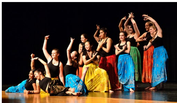
The night ended with a finale per- formance by all the dancers.