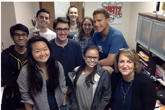
"Fox Tales Quarterly" won first place in the 2016 American Scholastic Press Association's Annual Newspaper Competition.

Fox Chapel Area High School's 2015-2016 student news publication "Fox Tales Quarterly" has been