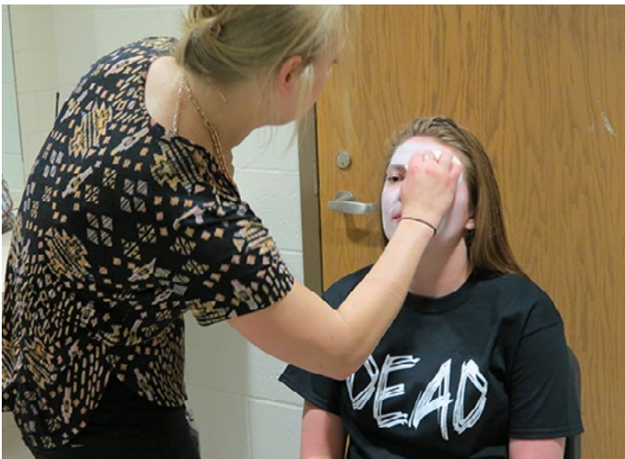
Throughout the day, students were pulled out of class to be dressed in "DEAD" shirts and face-painted with white paint.