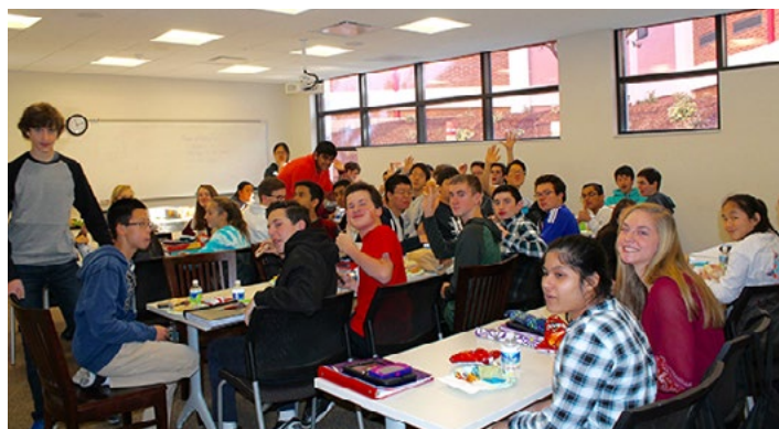
AMC test-takers enjoy a well-deserved luncheon after exhausting themselves in the competition.