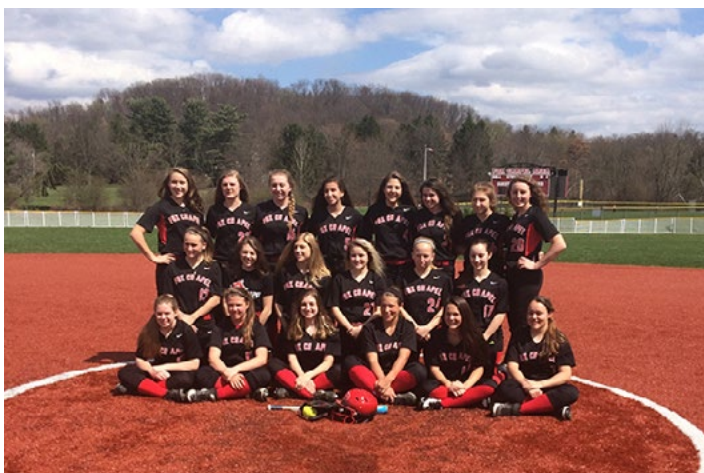
This season's softball team faced its challenges but succeeded in making it to playoffs and worked hard as a team.

Next year, the softball team will move to a new section, 6A section 2, a much harder and intense section then we are used to. Hopefully, the team will be able to achieve just as much there and stay competitive with the other talented teams. I wish them nothing but the best next year as they take on a new section and season!