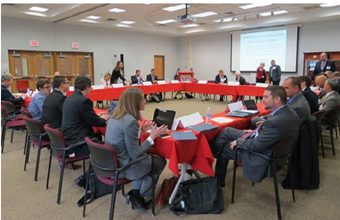
The Northern Area Principals Association (featured above in their last meeting of the year) convenes to discuss local education policy.

More information about the bills, the leaders present at the meeting and state education policy can be found at www.education.pa.gov and www.legis.state.pa.us .