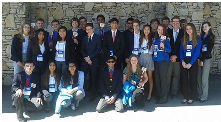
Many FCAHS students attended the Pennsylvania TSA State Leadership Conference at Seven Spring Conference Center.

Founded in 1978, TSA is the only student organization devoted exclusively to the needs of students interested in STEM (Science, Technology, Engineering, and Mathematics). The state conference culminated with an awards banquet during which many students were recognized for their achievements.