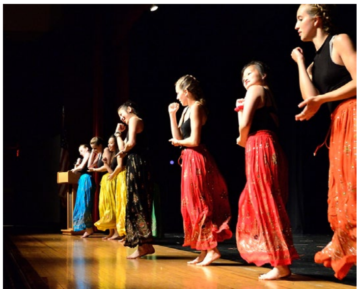
The Modern Bollywood dancers per- forming.