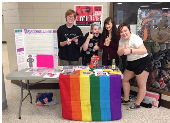
May 6th was the Day of Silence, an event coordinated by GLSEN when students may decide to remain silent to call attention to discrimination towards LGBTQIA+ individuals.

Members of the FCA Gender and Sexuality Awareness Club passed out GLSEN explanation cards, rainbow ribbons, stickers, and candy for participants. GSA students also set up an information table to discuss gender and sexual orientation, current political issues, and Transgender Awareness Week, a national event that FCA commemorated at the same time. While controversies over transgender visibility, bathroom laws, and gay marriage continue to broil in other districts and states, dozens of FCA students attempted to peacefully advocate for the community, with teachers aware that their classes might have been quieter on that day.