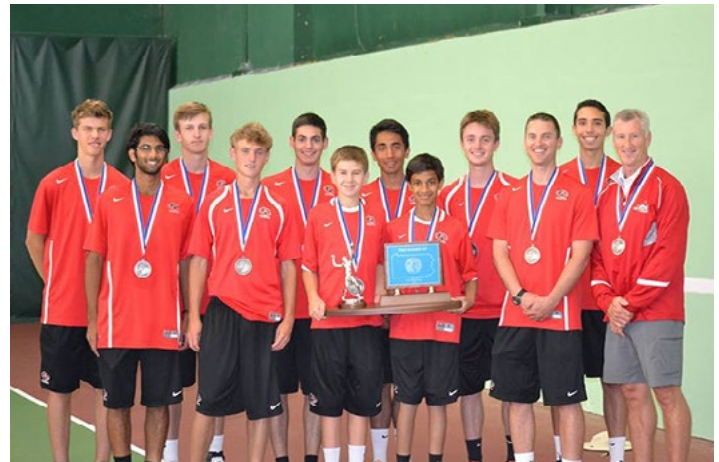
The boys at the end of their season.