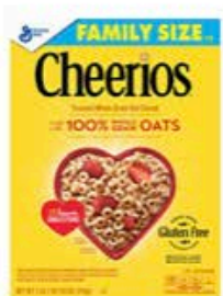
Flat Empty Cereal Boxes