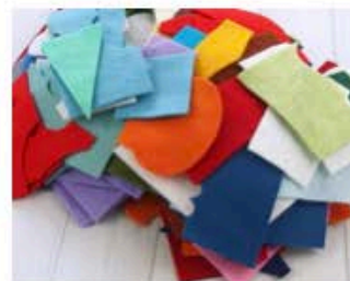
Felt or Fabric Scraps