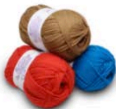
Yarn, String, Thread and Rubber Bands