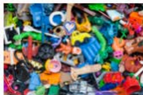
Small Plastic Toys You No Longer Want Or Need