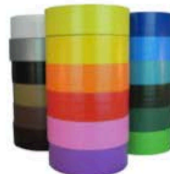
Duct, Masking or Scotch Tape