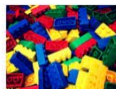
Wood Blocks and Legos

...and pretty much anything else you think would help make an awesome creation!