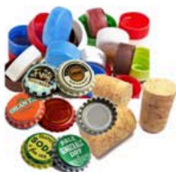
Plastic Bottles, Bottle Caps and Corks