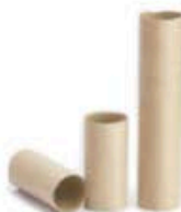
Gift, Paper Towel and Toilet Paper Tubes