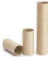
Gift, Paper Towel and Toilet Paper Tubes