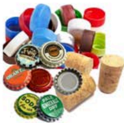
Plastic Bottles, Bottle Caps and Corks