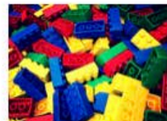
Wood Blocks and Legos

...and pretty much anything else you think would help make an awesome creation!