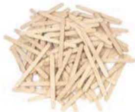
Popsicle Sticks, Straws and Pipe Cleaners