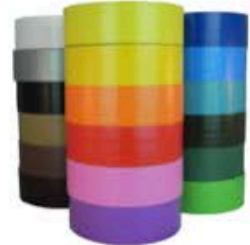
Duct, Masking or Scotch Tape