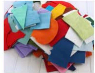
Felt or Fabric Scraps