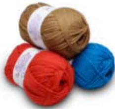
Yarn, String, Thread and Rubber Bands