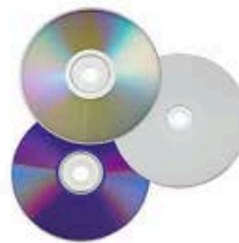
CDs and Old Computer/Electronic Parts