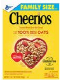
Flat Empty Cereal Boxes