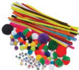
Unwanted Art and Craft Supplies