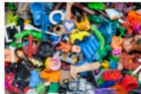
Small Plastic Toys You No Longer Want Or Need