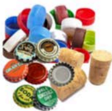
Plastic Bottles, Bottle Caps and Corks