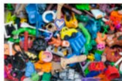
Small Plastic Toys You No Longer Want Or Need