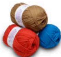
Yarn, String, Thread and Rubber Bands