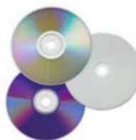
CDs and Old Computer/Electronic Parts