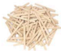
Popsicle Sticks, Straws and Pipe Cleaners