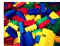
Wood Blocks and Legos

...and pretty much anything else you think would help make an awesome creation!