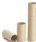
Gift, Paper Towel and Toilet Paper Tubes