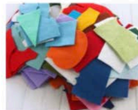
Felt of Fabric Scraps