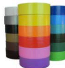
Duct, Masking or Scotch Tape