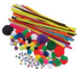
Unwanted Art and Craft Supplies