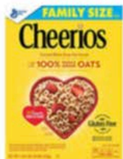
Flat Empty Cereal Boxes