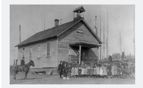
Eureka School House in Hockinson, 1889

How much do you know about your community? Learn some fun facts and historic landmarks with our map on page 4!