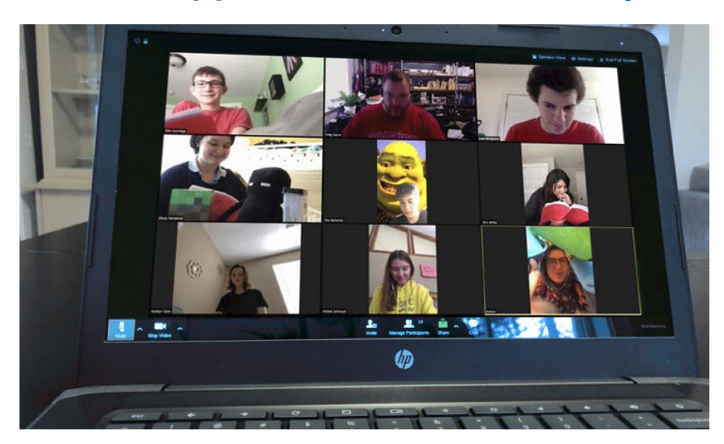
Middle schoolers check in with their classmates and teacher via Zoom.

Families, students and educators received a crash course in at-home learning this spring, as schools across the country took the unprecedented step of closing their doors to help slow the spread of COVID-19.