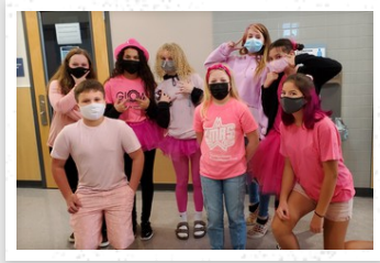
PINK OUT DAY