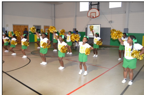
Central Elementary School cheerleaders perform during open house