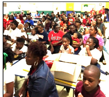
Fort Deposit Elementary welcomes Parents and Students back to school