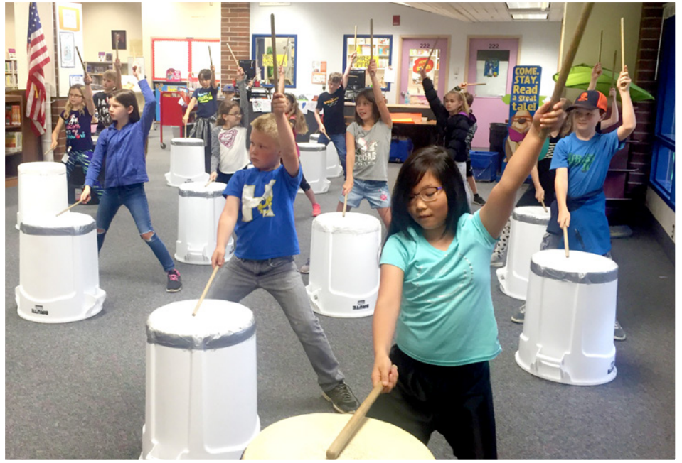
Third graders learn about rhythm, posture, math and Japanese culture through taiko drumming.