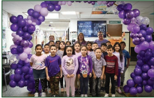
Oak Park P.S. I Love You Day Students and staff at Oak Park Elementary pose in front of the purple and white balloon arch on Feb. 10, also known as P.S. I Love You Day. The districtwide celebration of mental health awareness saw

Hartmann as the students counted down to the 100th day of school.