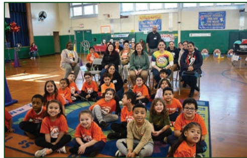
Pine Park Count on Parents Week Parents, staff and students pose for a picture in the Pine Park gymnasium to kick off "Count on Parents" Week on Feb. 13. The celebration included a special virtual assembly with YouTube star Jack