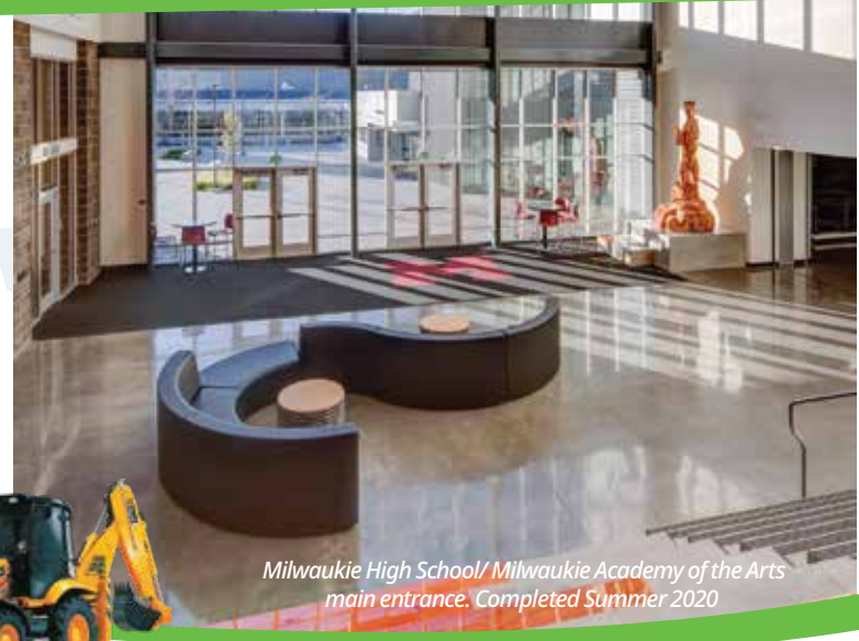
Milwaukie High School/ Milwaukie Academy of the Arts main entrance. Completed Summer 2020