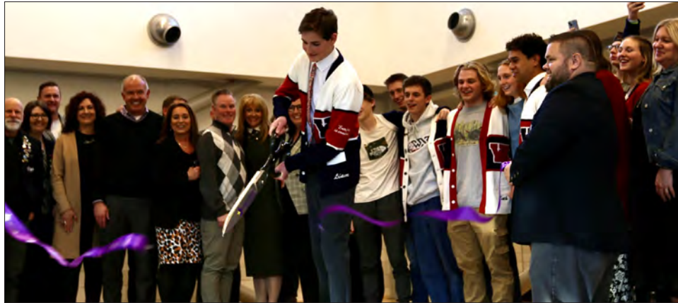
Student Body Officer cuts ribbon at Woods Cross High School Teen Center opening

After the speeches concluded, representatives from the Davis