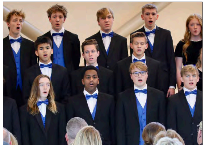
Woods Cross High Choir performs at Teen Center opening