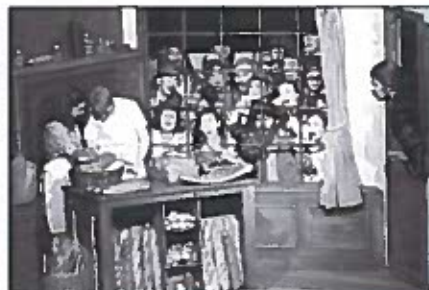
The Baker's Wife (2009)