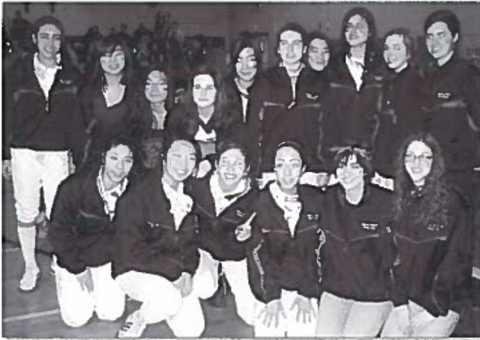
✓ Girl's Fencing...State Champions!