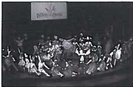
Beauty and the Beast (2008)