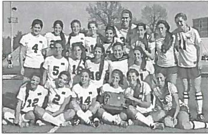
Girls Soccer: Big North Divisional, Bergen County, State Sectional and State Group 3 Champions - undefeated season 24-0! Currently ranked #1 in the State and #4 in the nation!