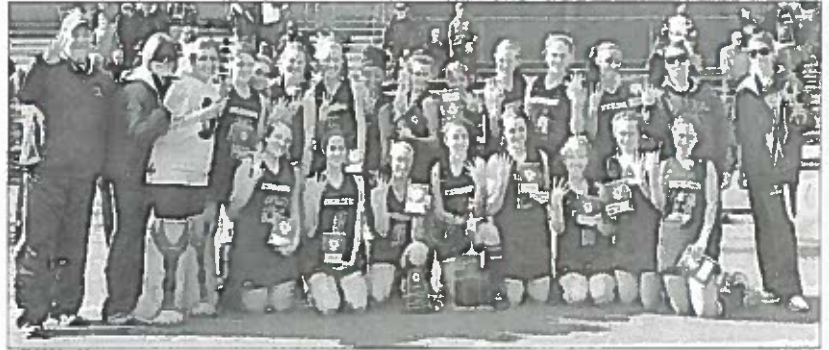
Field Hockey: Bergen County Champions – 4th year in a row!