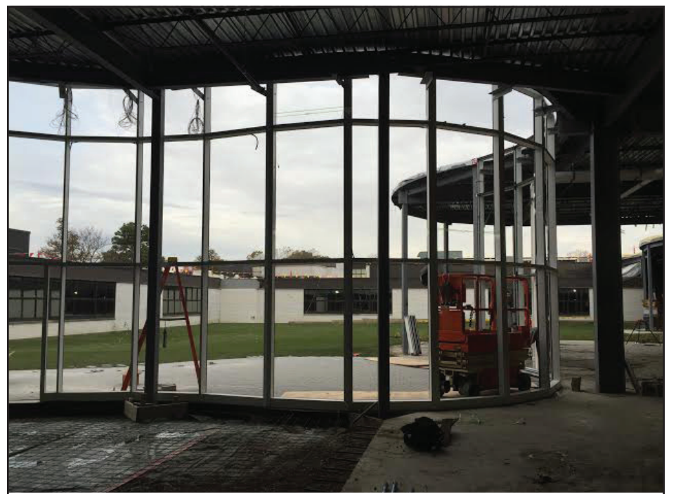
A view from the new student cafeteria.