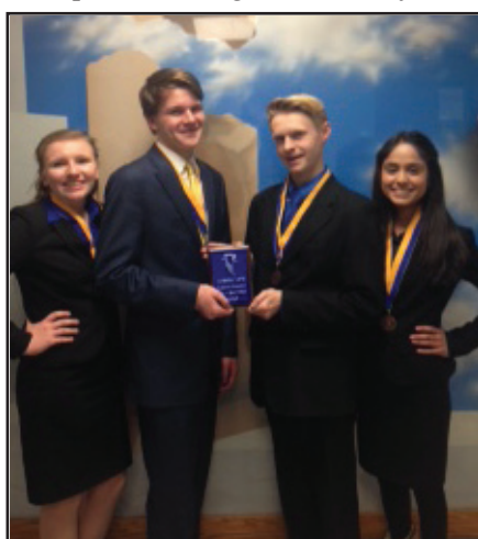
Wheaton North finalists.