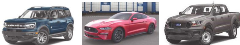
Pictures are representative of the vehicles but not actual vehicles, as they have not arrived yet.

With your support, everyone is a winner. Your purchase provides additional financial support for the church and you could win a prize too. Please return tickets, sold and unsold, to the parish office by Thursday April 20 or directly to All Saints by Tuesday, April 25.