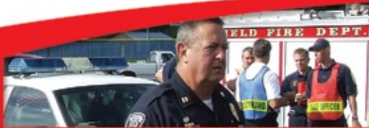
Adversarial, Incidental, and Human-caused Threats