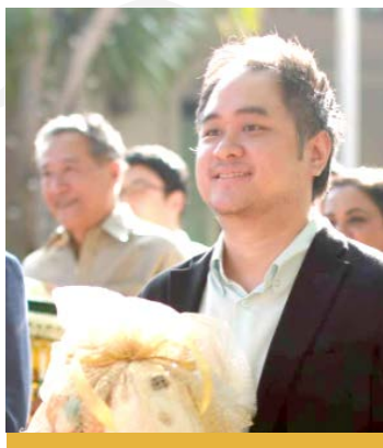
Gun Lianyi Ti

which are developed to world class standards. We will strongly recommend ISB to any family."