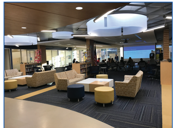
Perin Learning Commons