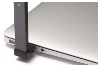
JUUL device charging in the USB port of a laptop.

JUUL Labs produces the JUUL device and JUULpods, which are inserted into the JUUL device. In appearance, the JUUL device looks quite similar to a USB flash drive, and can in fact be charged in the USB port of a computer. According to JUUL Labs, all JUULpods contain flavorings and 0.7mL e-liquid with 5% or 3% nicotine by weight; JUUL Labs claims that the 5% pods contain the equivalent amount of nicotine as a pack of cigarettes. JUULpods come in eight flavors: Mango, Fruit, Cucumber, Creme, Mint, Menthol, Virginia Tobacco and Classic Tobacco. 1 Other companies manufacture “JUUL-compatible” pods in additional flavors; for example, the website Eonsmoke sells JUUL-compatible pods in Blueberry, Silky Strawberry, Mango, Cool Mint, Watermelon, Tobacco, and Caffé Latte flavors. 2 There are also companies that produce JUUL “wraps” or “skins,” decals that wrap around the JUUL device and allow JUUL users to customize their device with unique colors and patterns (and may be an appealing way for younger users to disguise their device).