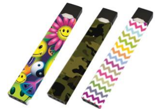
JUUL skins. Images from https://www.mightyskins.com/juul/

JUUL Labs produces the JUUL device and JUULpods, which are inserted into the JUUL device. In appearance, the JUUL device looks quite similar to a USB flash drive, and can in fact be charged in the USB port of a computer. According to JUUL Labs, all JUULpods contain flavorings and 0.7mL e-liquid with 5% or 3% nicotine by weight; JUUL Labs claims that the 5% pods contain the equivalent amount of nicotine as a pack of cigarettes. JUULpods come in eight flavors: Mango, Fruit, Cucumber, Creme, Mint, Menthol, Virginia Tobacco and Classic Tobacco. 1 Other companies manufacture “JUUL-compatible” pods in additional flavors; for example, the website Eonsmoke sells JUUL-compatible pods in Blueberry, Silky Strawberry, Mango, Cool Mint, Watermelon, Tobacco, and Caffé Latte flavors. 2 There are also companies that produce JUUL “wraps” or “skins,” decals that wrap around the JUUL device and allow JUUL users to customize their device with unique colors and patterns (and may be an appealing way for younger users to disguise their device).