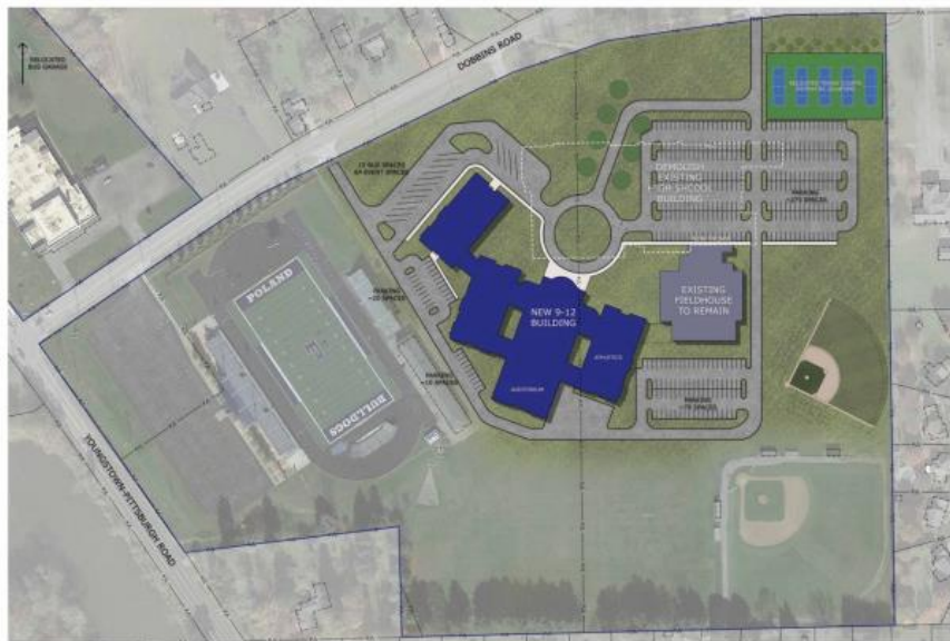
POLAND SEMINARY HIGH SCHOOL SITE FIT PLAN - CONCEPT ONLY - NOT FINAL POLAND, OH

THE COLORS AND HATCHING SHOWN IN THE RENDERING ARE CLOSE APPROXIMATIONS AND NOT AN EXACT MATCH. RENDERING IS TO BE CONSIDERED FOR VISUAL REPRESENTATION ONLY AND NOT FOR CONSTRUCTION.