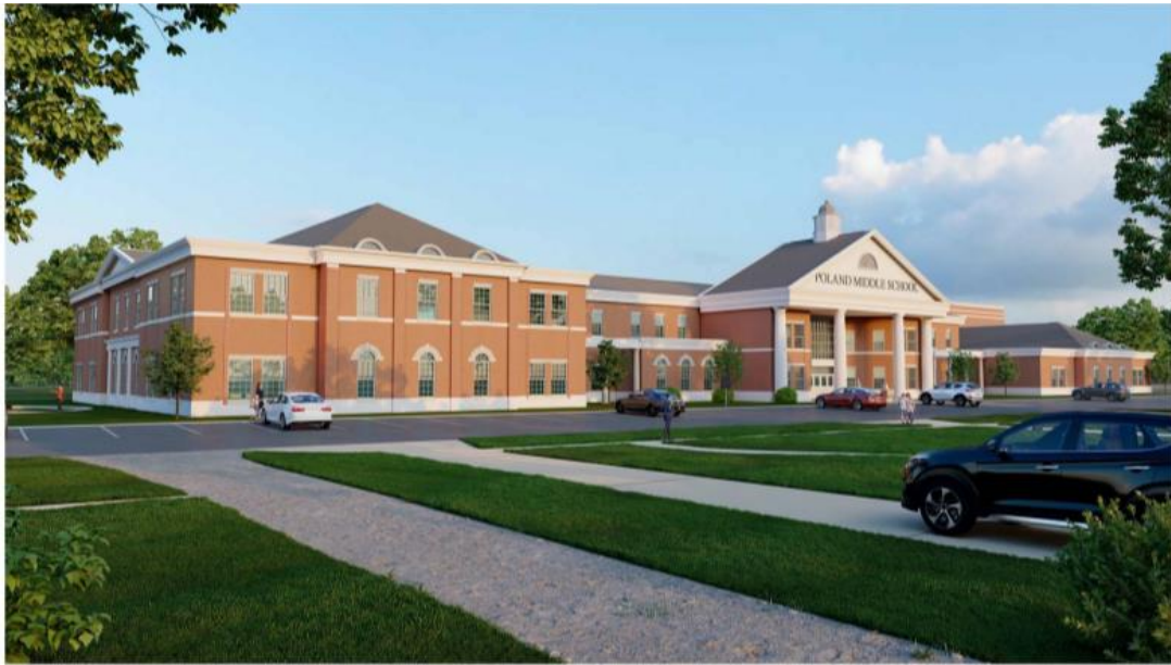
POLAND 6-8 SCHOOL CONCEPT ONLY - NOT FINAL POLAND, OH