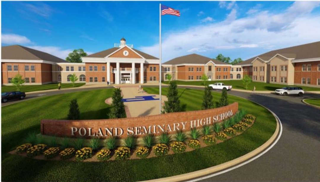
POLAND SEMINARY HIGH SCHOOL CONCEPT ONLY - NOT FINAL POLAND, OH