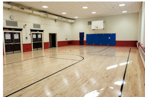
Fully-renovated gymnasium at Jefferson School.

In preparation for each new school year, the district invests in capital infrastructure to improve our school buildings and grounds. Many renovations have been made throughout all of our schools this past summer. These include facility upgrades to classrooms, hallways, and shared spaces, both indoors and out.