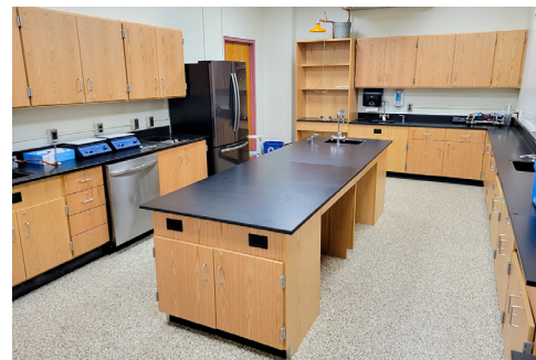
A new STEM laboratory at BHS.

In preparation for each new school year, the district invests in capital infrastructure to improve our school buildings and grounds. Many renovations have been made throughout all of our schools this past summer. These include facility upgrades to classrooms, hallways, and shared spaces, both indoors and out.