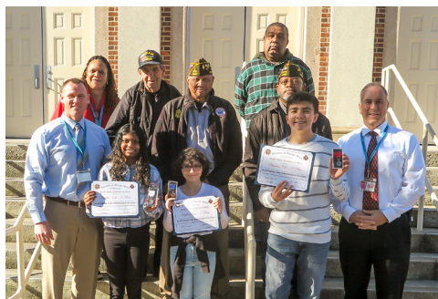
The winners pose with staff and veterans at RWB.