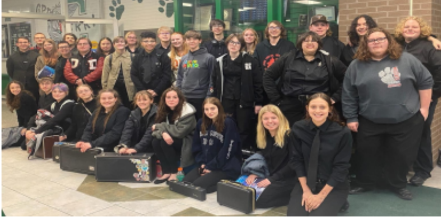
HS Concert Band (above) HS Choir (below)