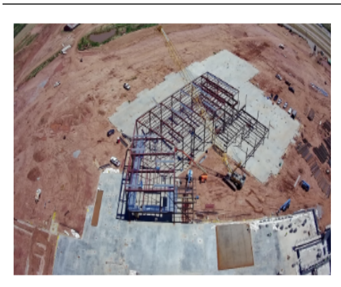
Area A & E Steel Erection Ongoing