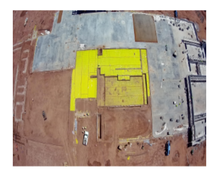
Area G Slab on Grade Prep (Auditorium)