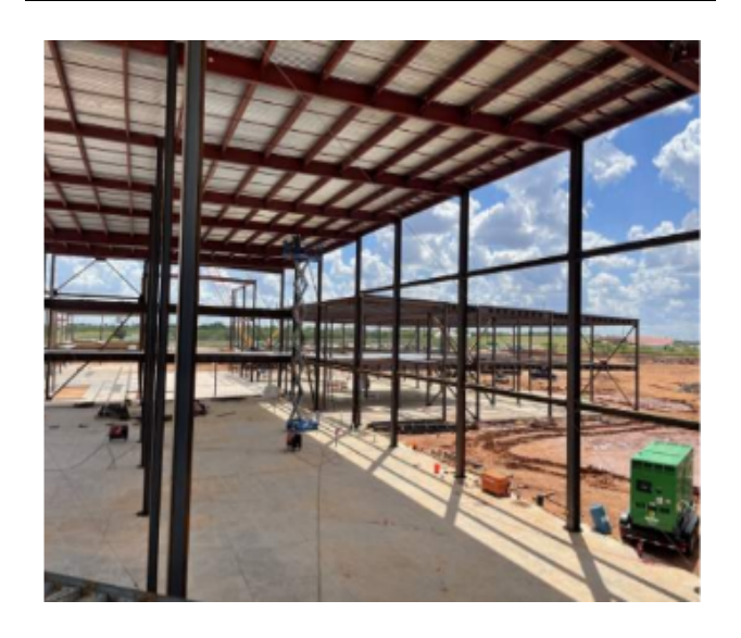
Area P & T Steel Level 2