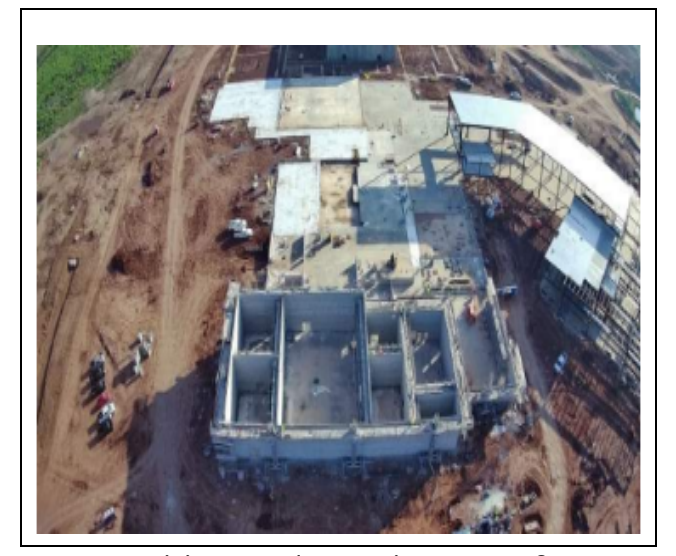
Concrete Slab on Grade Complete Area G & J