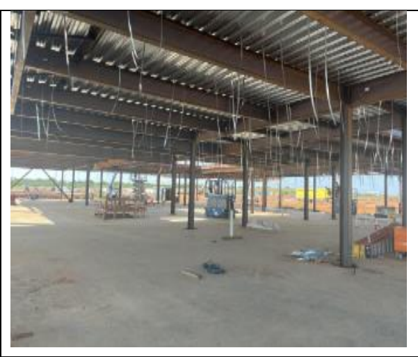
Area A & E Overhead Hangers and Sraps