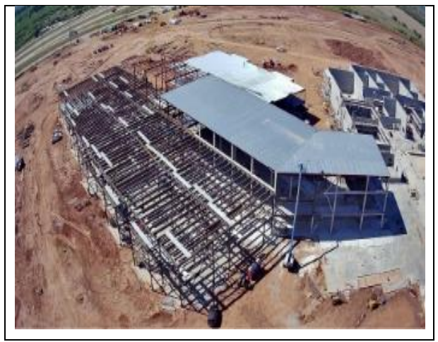
Area D Steel Erection Complete