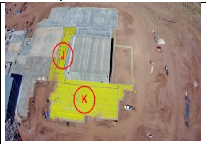
Area J & K Slab on Grad Prep