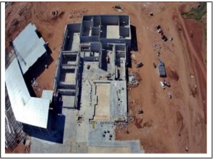
Area F & G CMU