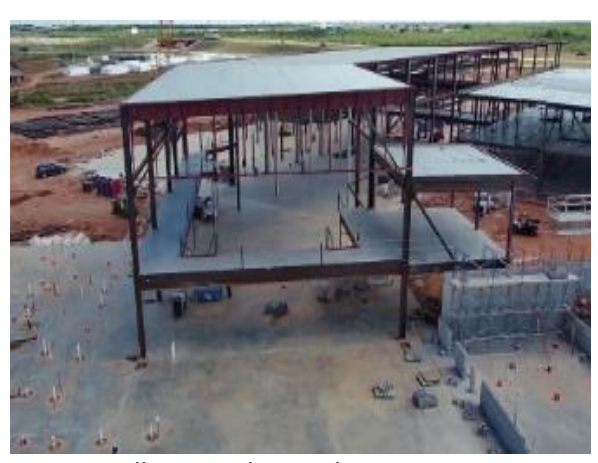
Area T Walkway and Art Balcony