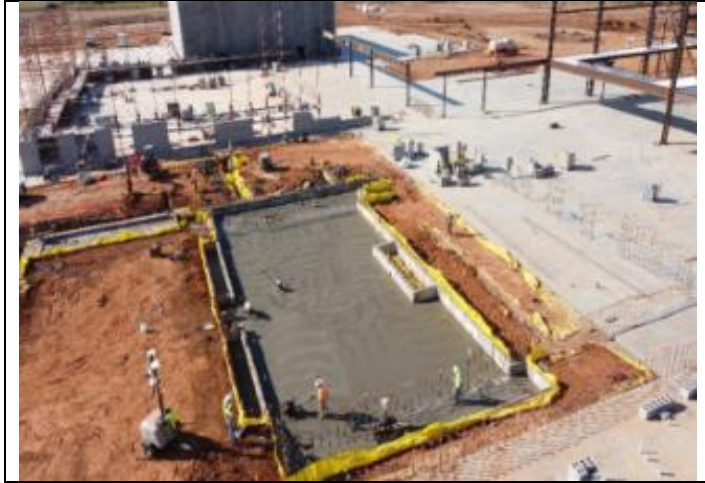
Area G2 Pour