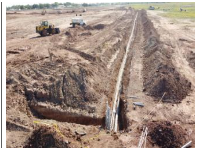
Continue Electrical Primary Feeder