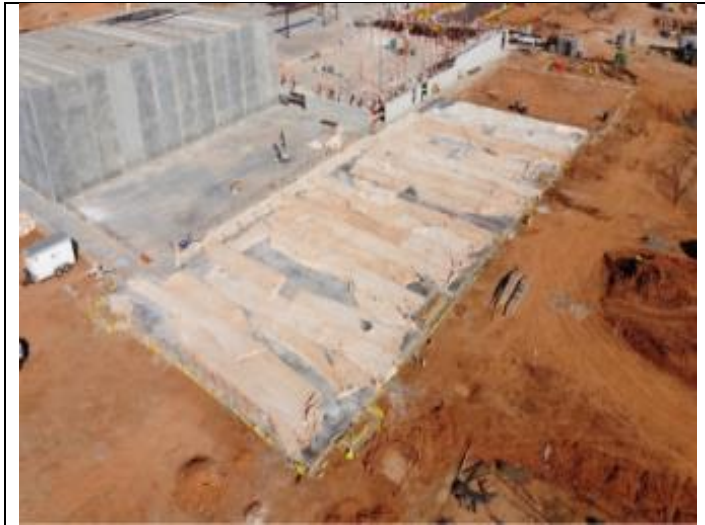
Area M Slab Pour