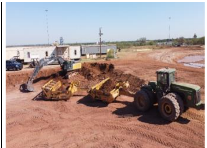
Continue Cut & Fill Sitework near Construction Office