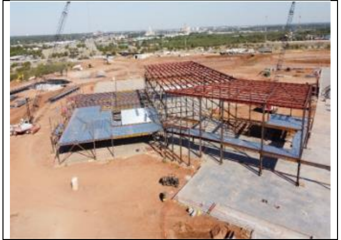
Area D & E Steel Erection