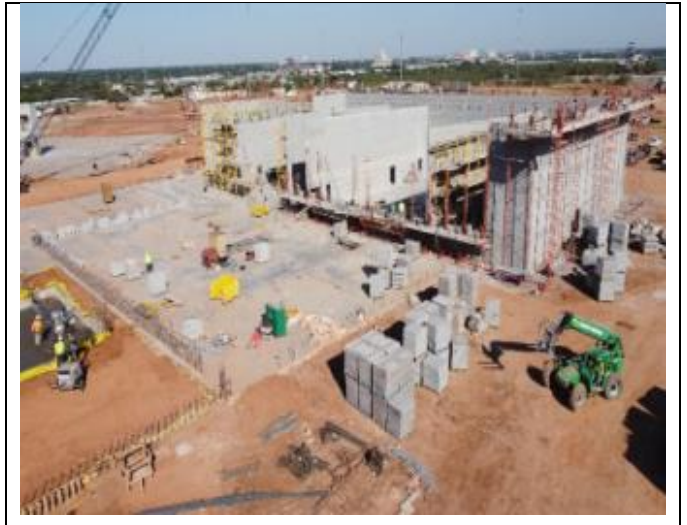
CMU Ongoing Area F