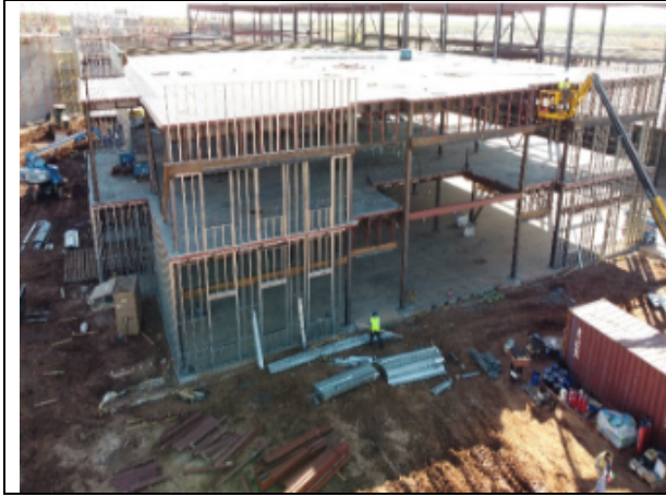
Area A Exterior Cold Form Stud Framing