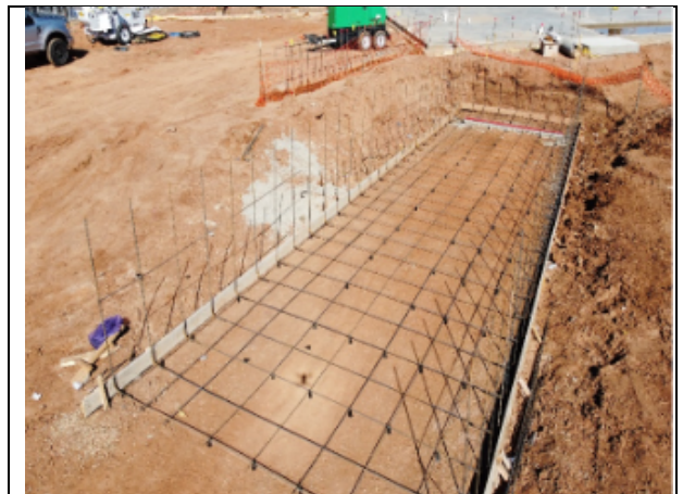
Loading Dock pavement reinforcing