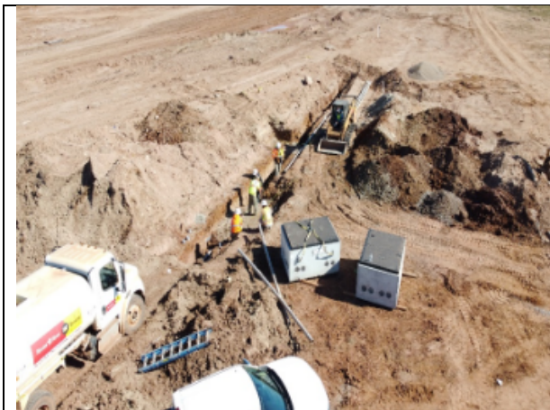
Primary Electric pullboxes