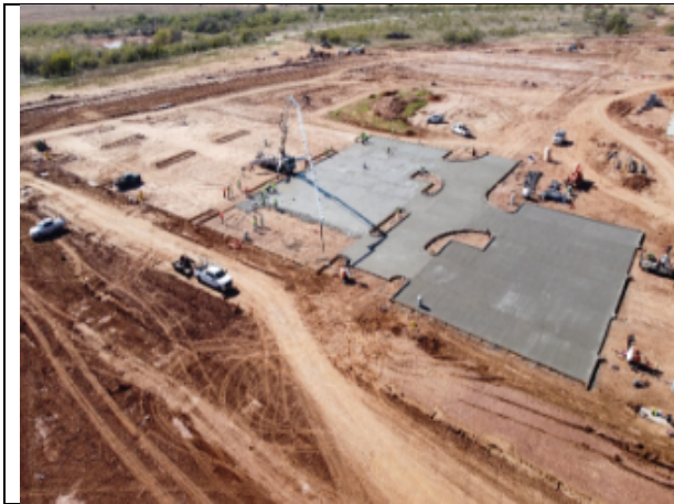
Paving Southeast Parking Lot