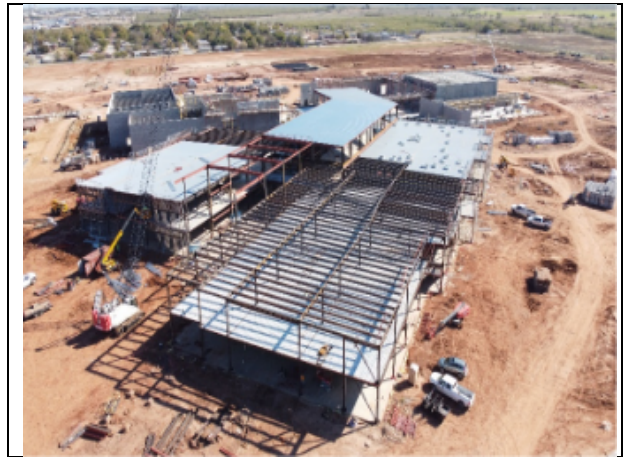
Area B & C Structural Steel Erection