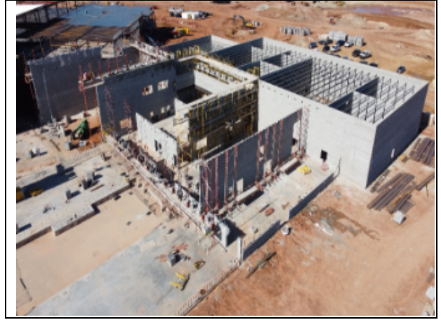
Area F & G CMU walls