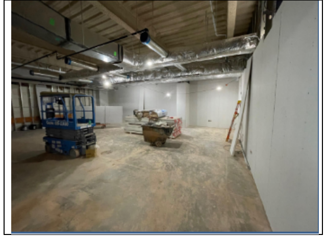
Area A Computer Lab Drywall