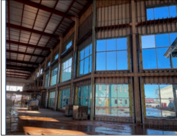
Area E Windows Courtyard Side