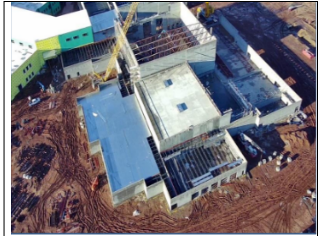
Area K & N Roofing & Joists