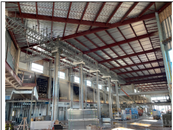
Area E Commons Corridor