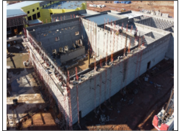
Area G Steel Erection