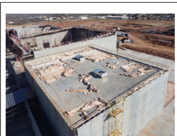
Storm Shelter Roof Poured