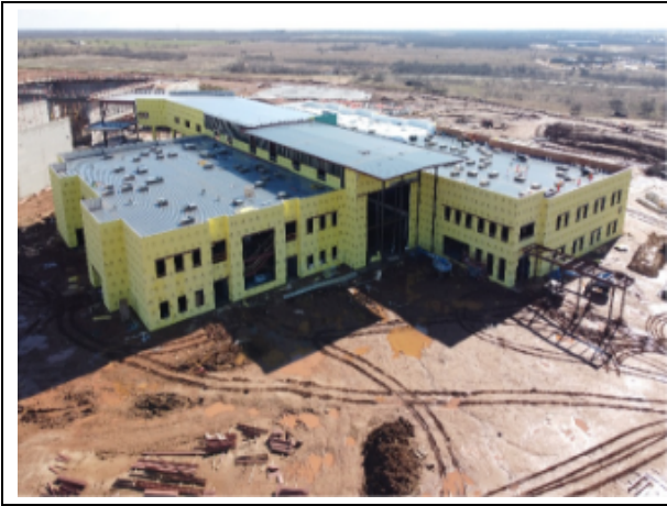
Exterior Framing/Sheathing Areas A-E