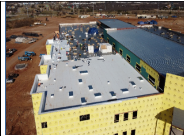
Roofing Area D