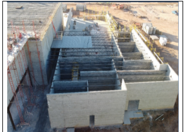
Steel and CMU @ Area K