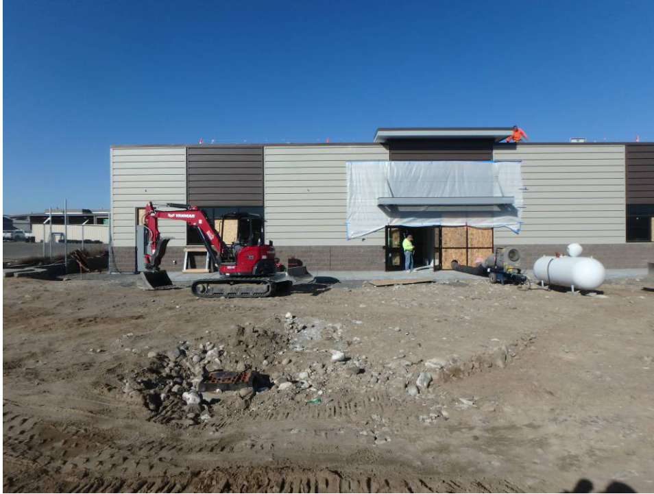
East elevation, south end