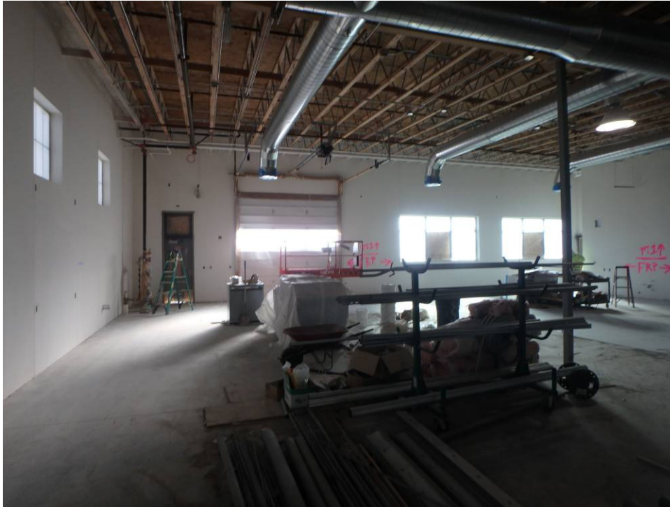
Standpipe and the east wall of the shop