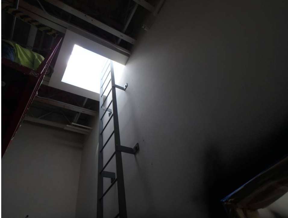
Ladder to roof