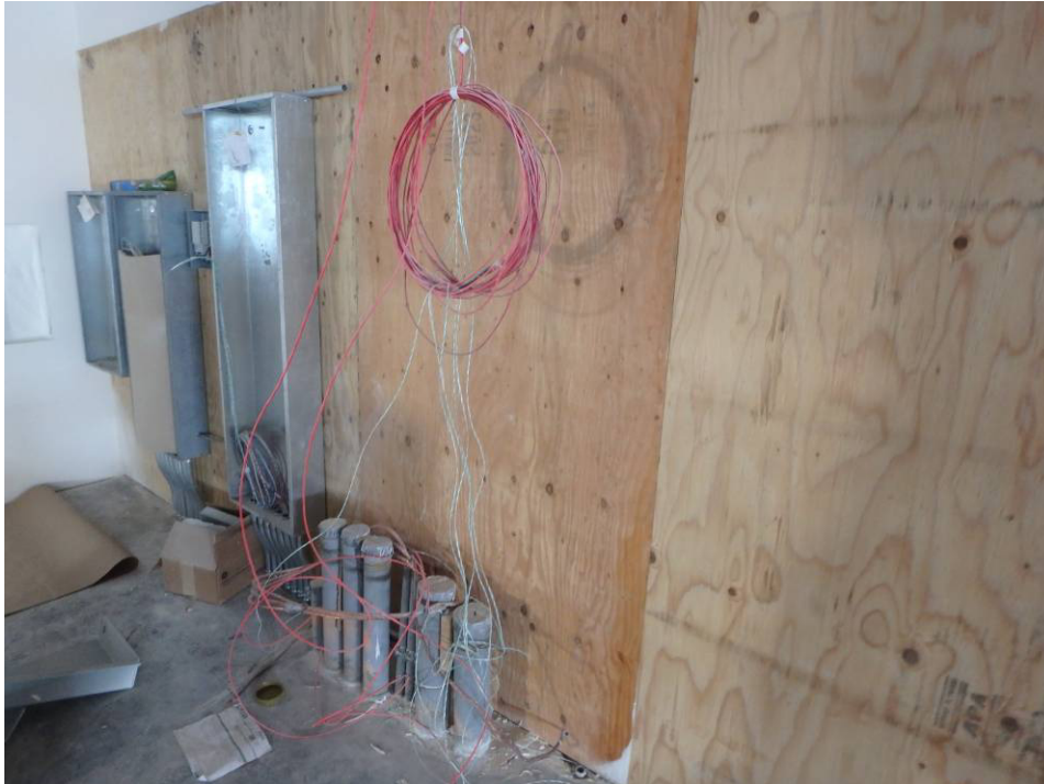
Electrical panel backboard and cans