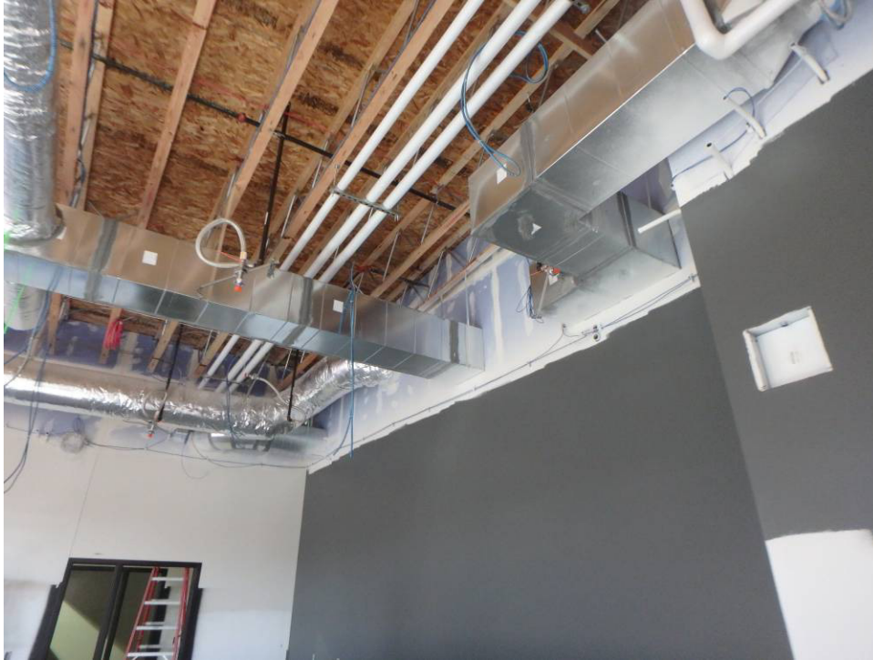
North wall of the south classroom with the accent color