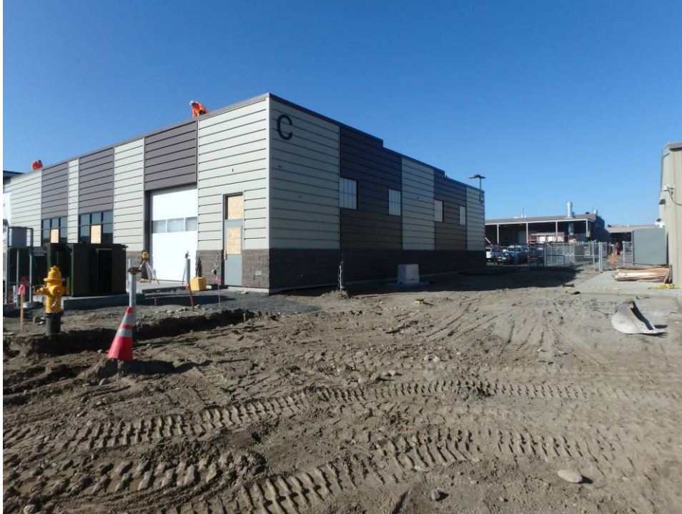
Northeast corner and northeast doors