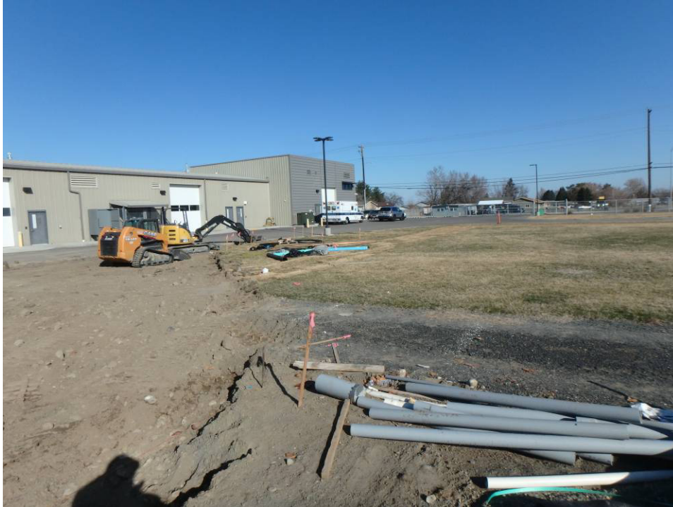
North site, sod and PVC Pipe stubups – to be flush with grass surface