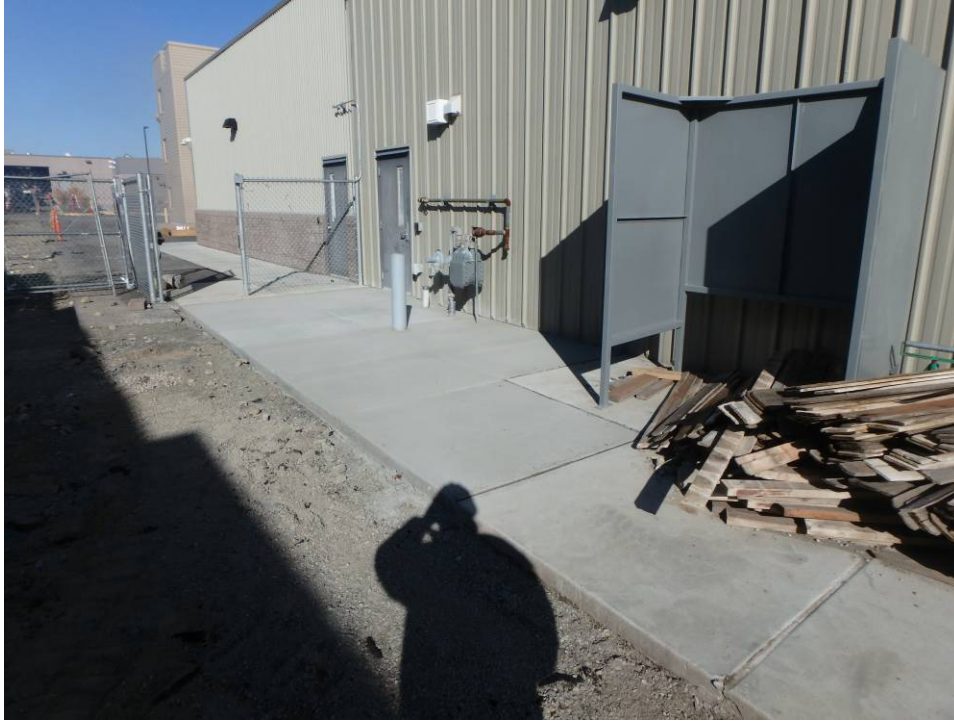
South elevation of Tri Tech East