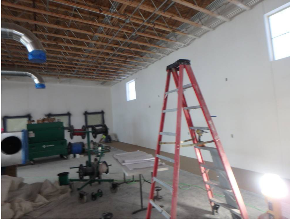
Looking across to the Northwest corner of the shop and north wall