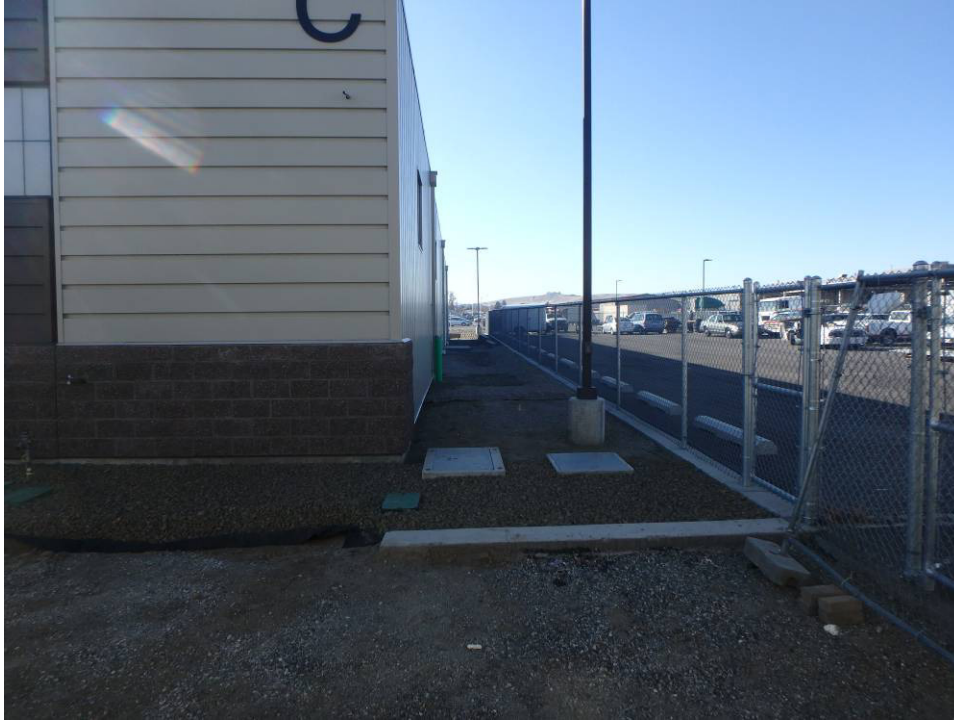
Southwest corner siding, west property line and back of building