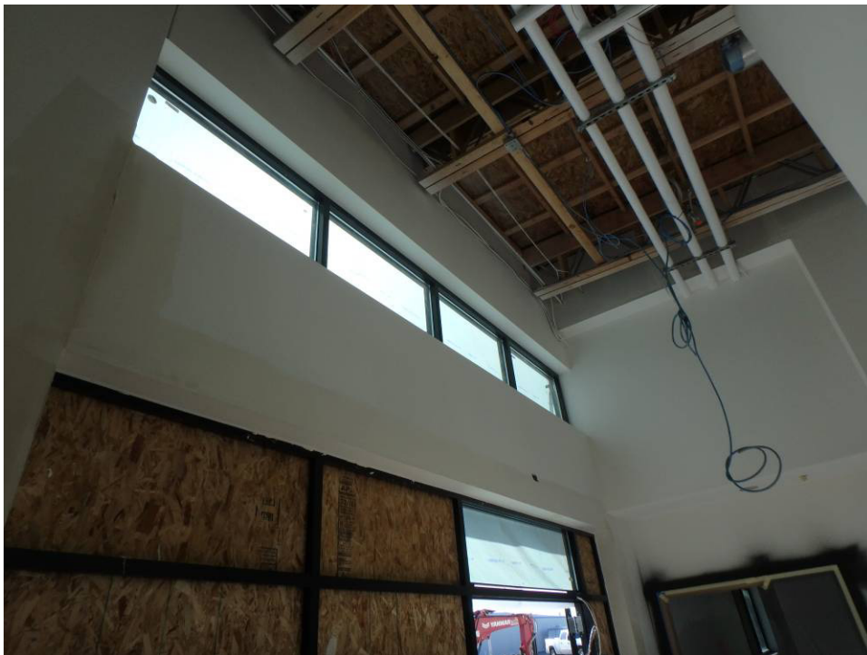
Main entry upper windows