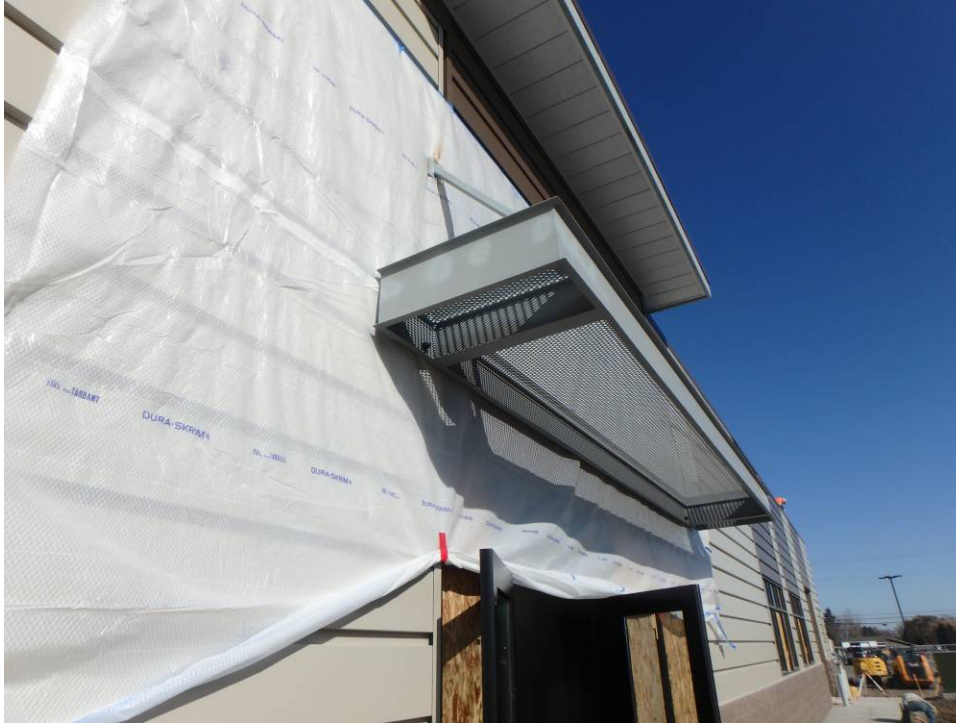
Front entry canopy