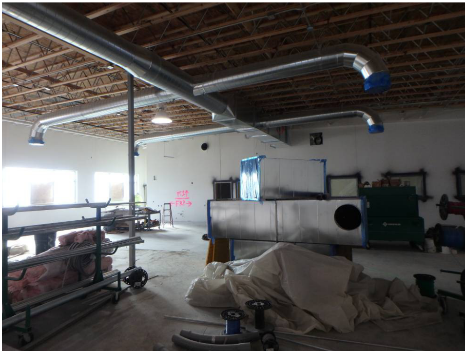
Looking south across the shop