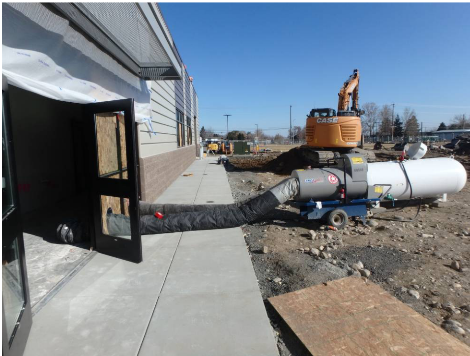
Front entry and sidewalk