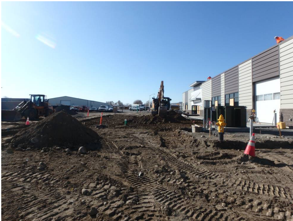
Looking south at the grading down to the base for the crush surfacing top course