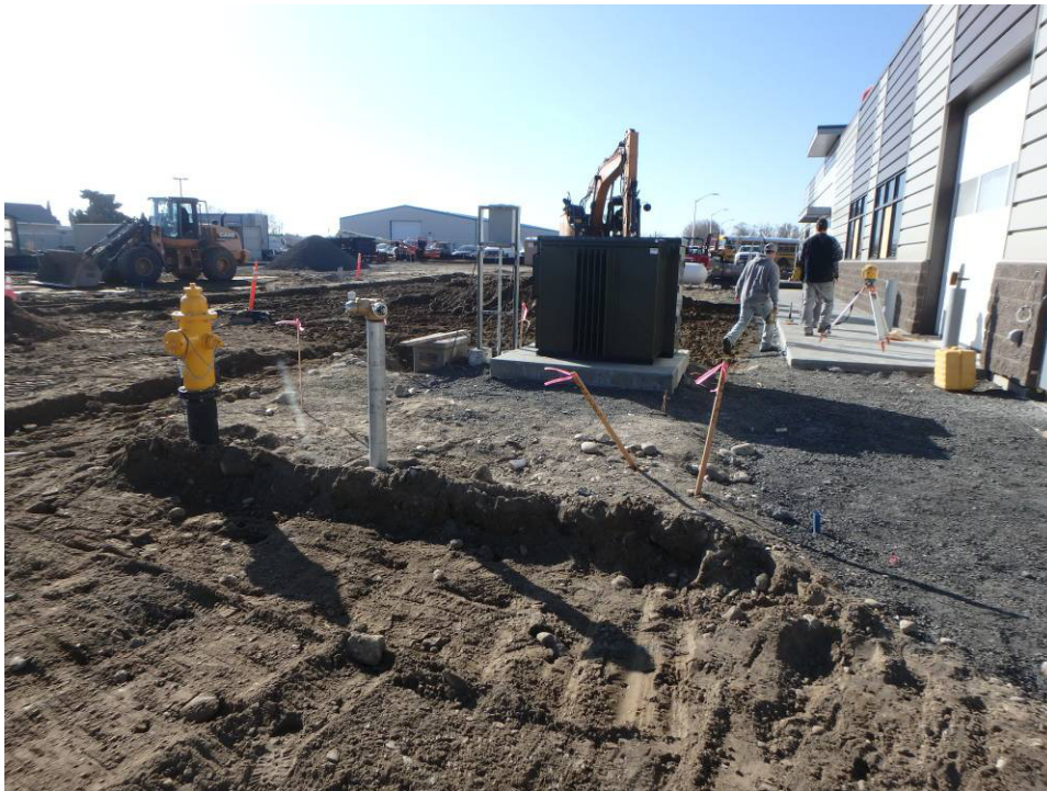
Looking south at the newly set transformer