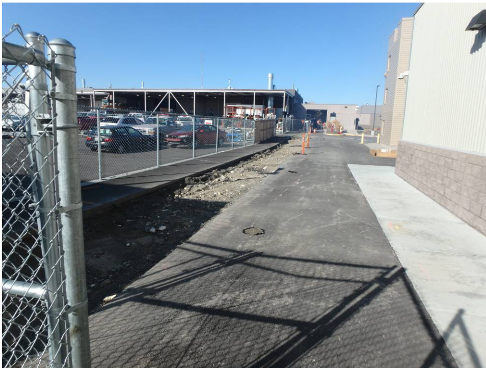
West waterline trench backfill