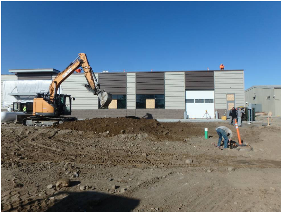
East elevation, north end