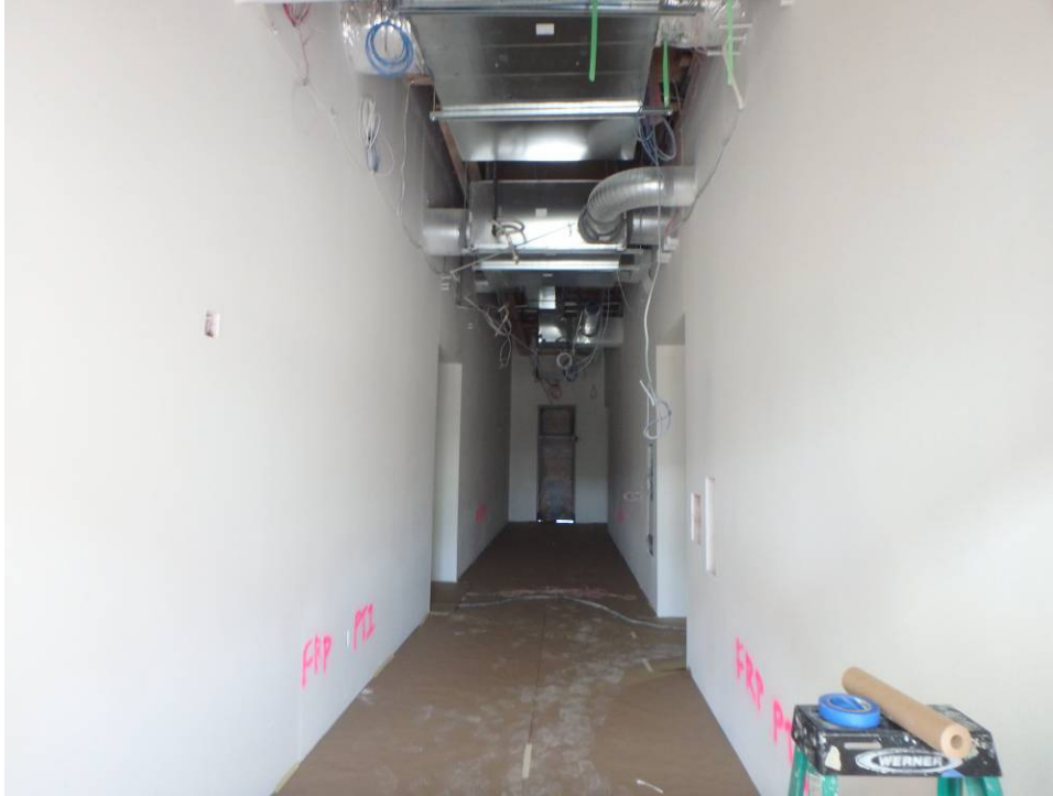
Main corridor looking west