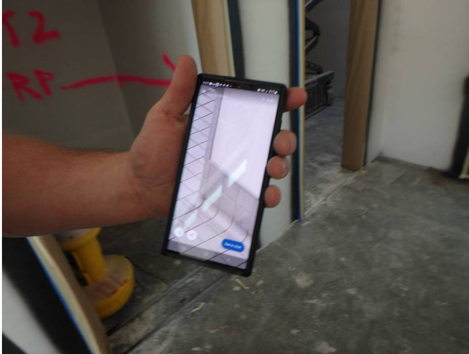
Bathroom tile coving example