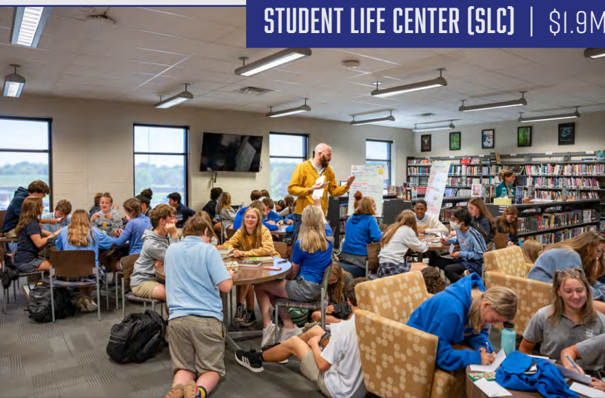
STUDENT LIFE CENTER (SLC) | $1.9M