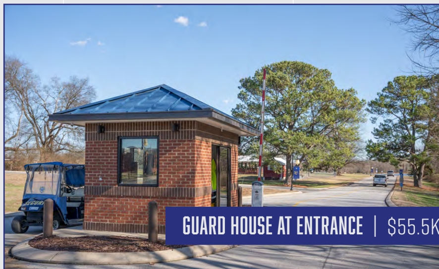
GUARD HOUSE AT ENTRANCE | $55.5K