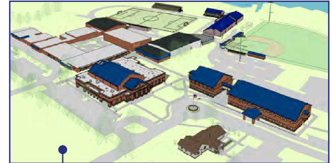
PERFORMING ARTS CENTER AERIAL VIEW