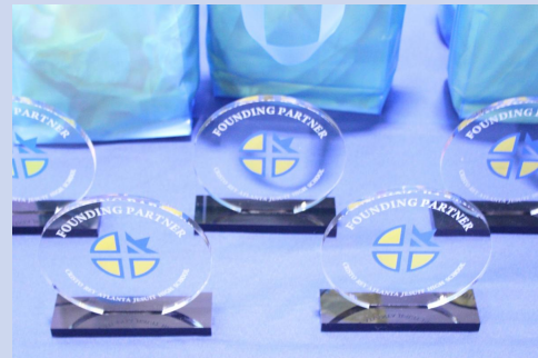
Founding Corporate Work Study Partners were honored