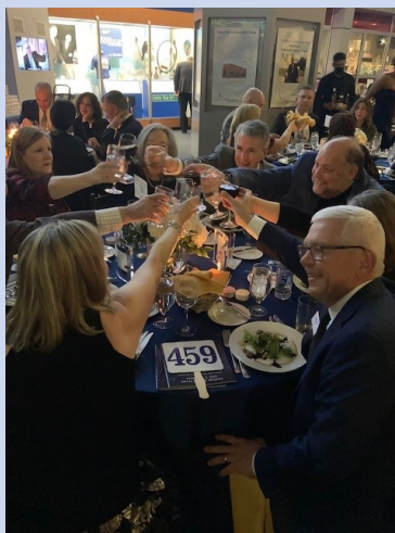
Guests cheered the evening and Cristo Rey Atlanta